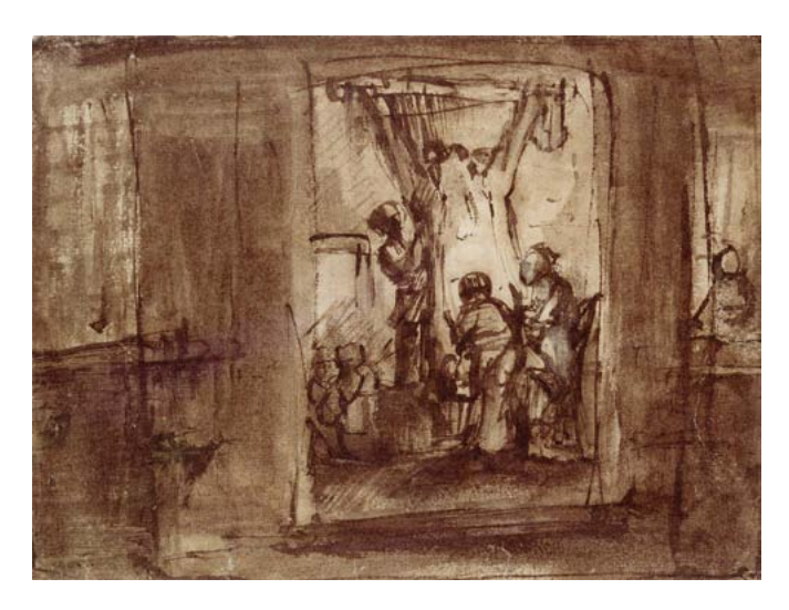
Rembrandt, «Slaughter Scene at Night», c. 1655, pen in brown, washed and heightened with white, 133 x 180 cm, Berlin, Staatliche Museen zu Berlin, KdZ 8516. Photo: author

Pork was far more available and affordable than beef, for those who could afford any meat at all. Sty pigs were common – peasants frequently raised swine for sale during autumn at nearby livestock markets. Such country markets also served