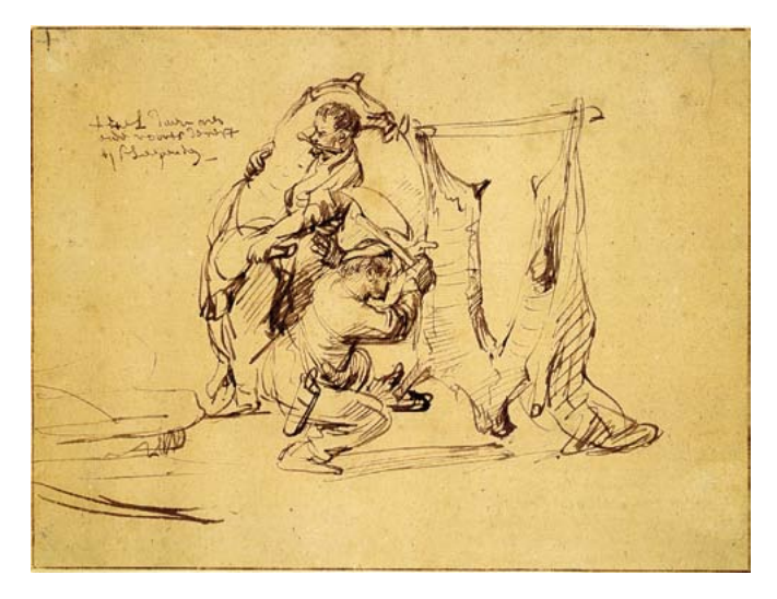
Rembrandt, «Two Butchers at Work on a Carcass», c. 1635, pen and brown ink, 14.9 × 20 cm (Ben 400), Frankfurt, Städelsches Kunstinstitut.