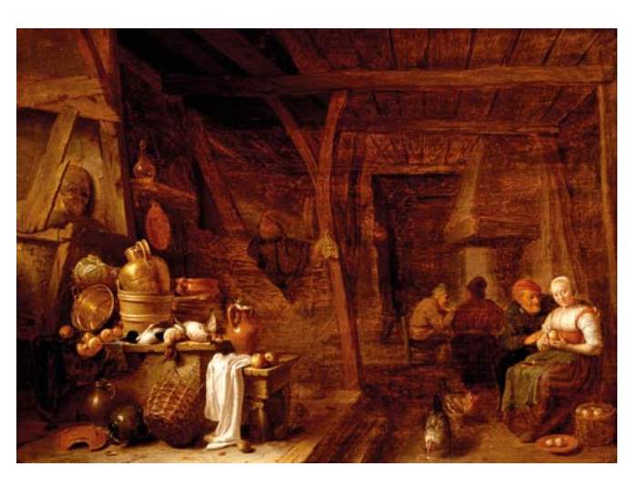
10. Hendrick Sorgh, «Interior of a Farmhouse», c. 1640, oil on panel, 46.5 × 68 cm, Rotterdam, Museum Boijmans Van Beuningen.