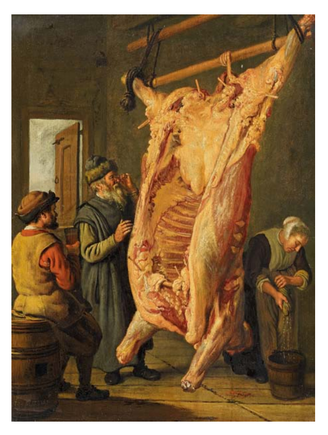
14. Jan Victors, «Slaughtered Ox», c. 1650–1670, oil on panel, 53 × 40 cm, Cologne, Kunsthaus Lempertz, 11 May 2003 (lot 1064).

The best-known depictions of flayed animals from the sixteenth century are by Pieter Aertsen, Joachim Beuckelaer, and Maarten van Cleve. Aertsen's famous 1551 Meat Stall has come down to us in four nearly identical versions (Uppsala, Raleigh, Amsterdam, and Maastricht), attesting to its success. Here the butchered ox head dominates an array of meat cuts on the market stall, while its headless carcass is juxtaposed with a genre display redolent of gluttony and frivolity. <sup>64</sup> Aertsen's followers developed the slaughtered carcass motif alone in compositions that concentrated on butchering, likely read as memento mori . In the next century, Flemish (rather than Dutch) artists continued to depict meat for sale.