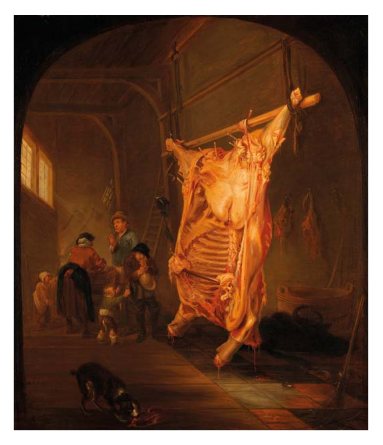
Abraham van den Hecken, «Slaughtered Ox», c. 1635–1655, oil on canvas, 114 × 98 cm, Amsterdam, Rijksmuseum.