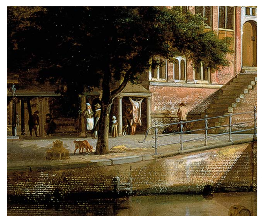
7. Jan van der Heyden, «View of the Westerkerk», oil on panel, 53.3 × 64.1 cm, Boston, Museum of Fine Arts, Promised gift of Rose-Marie and Eijk van Otterloo, in support of the Center for Netherlandish Art.