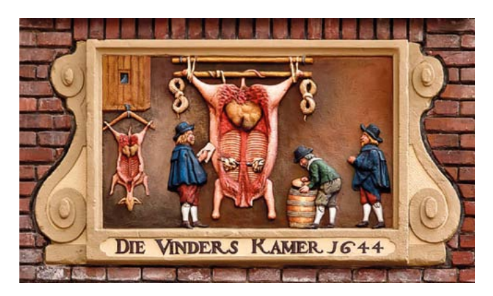
15. Relief (with polychromy restored) originally above the entrance to the Vinders Kamer, Grote Vleeshal, Amsterdam, now relocated to Oudezijds Voorburgwal 274, Amsterdam.

1640s, a slaughtered ox dominates the back room while pots and vegetables aggressively vie for attention up front [Fig. 11]. The human figures in these paintings raise the issue of gender, for it is typical of the genre that women are shown engaged in domestic work, while men chat and smoke. The man's hardest labour is over, the carcass hangs dripping and beginning to age. Only the presence of a chopping block signals work still to be done before delivering the beef to a market or rich kitchen. The only farmstead picture that eliminates human staffage is the Rembrandtesque panel (sometimes attributed to Adriaen van Ostade) in Budapest though it does include anecdotal details pointing to abundant human activity. 68 It is worth mentioning that in his much earlier ink drawing, Two Butchers at Work (c. 1635?), Rembrandt depicted the next steps: butchers cutting up a carcass - here a pig - for delivery [Fig. 12]. But this was an aspect of slaughtering never depicted in oil.