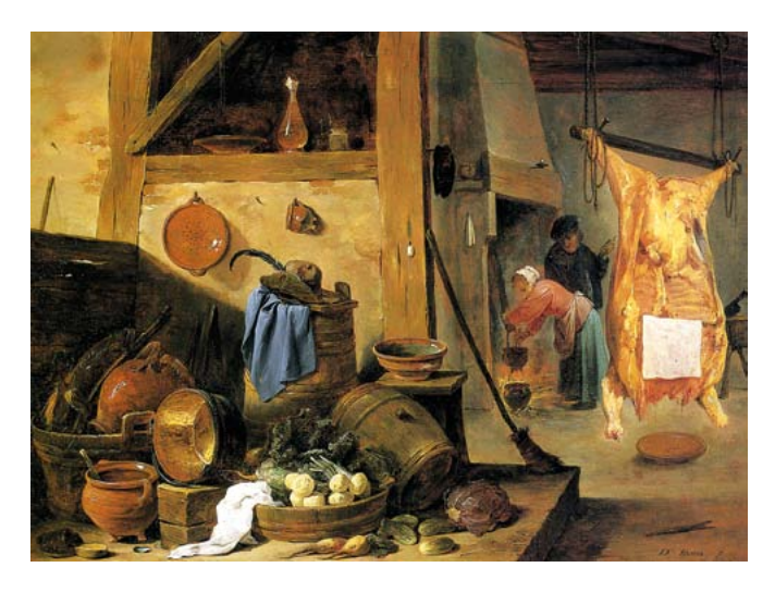
11. David Teniers, «Kitchen Interior with Still Life and Slaughtered Ox», early 1640s, oil on panel, 33 \times 44 cm, private collection.