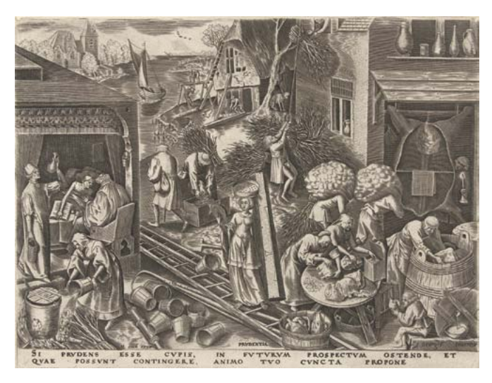
Pieter Bruegel the Elder, «Prudence», dated 1559, engraving attributed to Philip Galle, 225 × 293 mm (inscription: 'If you wish to be prudent, think always of the future and keep everything that can happen in the forefront of your mind'), Amsterdam, Rijksmuseum.