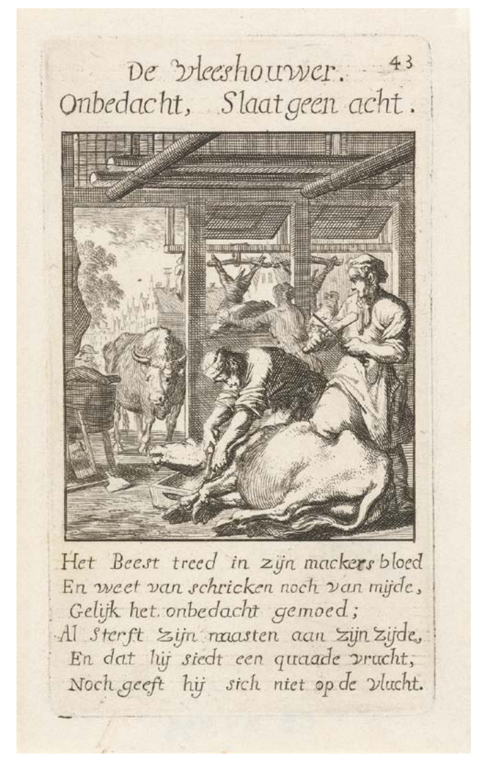
5. Jan and Kasper Luiken, «De Vleeshouwer», in Het menselyk bedryf, Amsterdam, 1694, no. 43, Amsterdam, Rijksmuseum.

and veterinary texts, husbandry manuals, emblems, and religious writings.<sup>41</sup> In light of the ox's cachet, it is no wonder that the prize at an annual Amsterdam civic guard competition – as pictured in a large, anonymous panel (Amsterdam Museum, 1564) for the Town Hall – was a gigantic ox rather than a pig.<sup>42</sup>