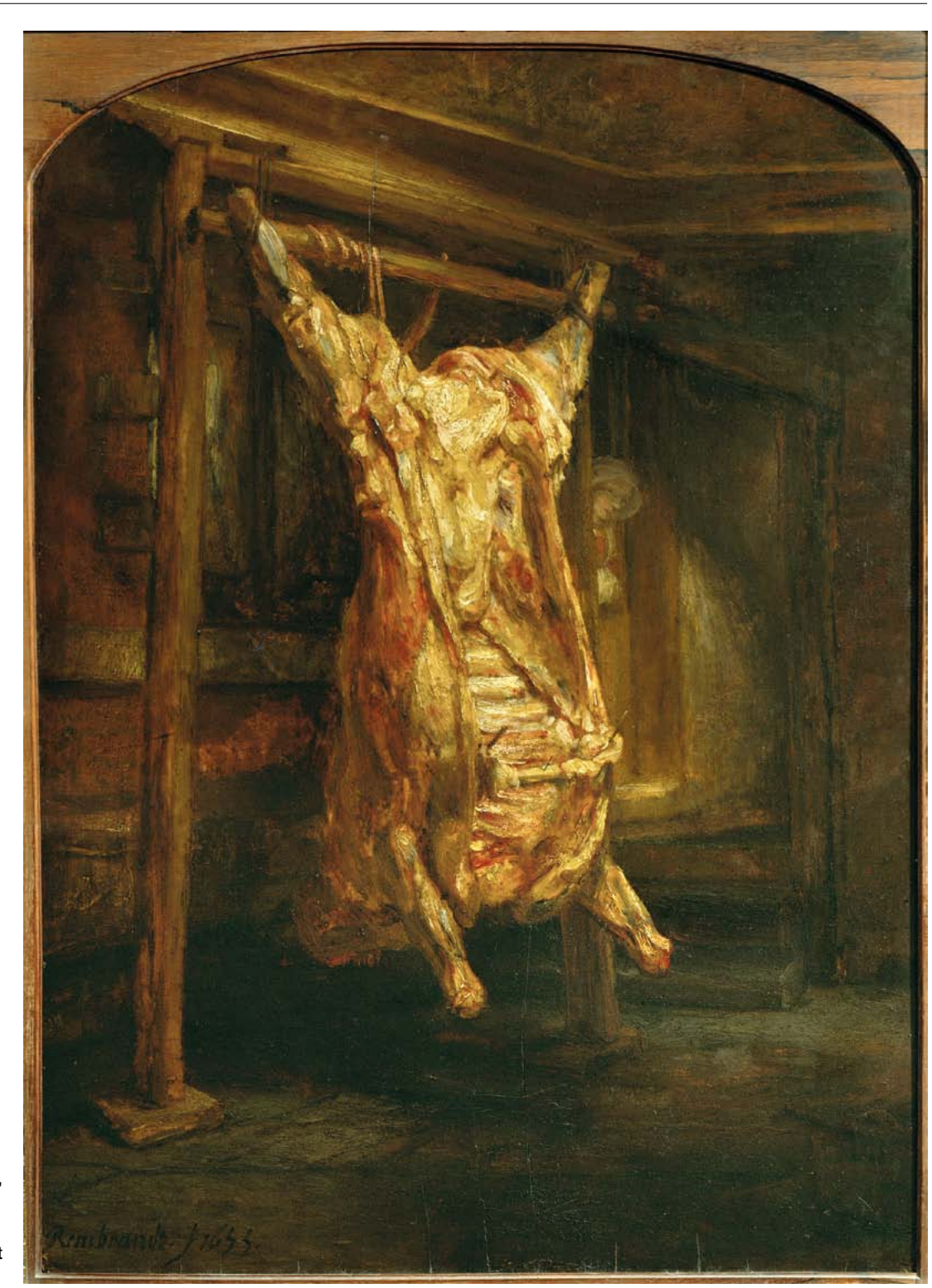
2. Rembrandt, «Slaughtered Ox», oil on panel, 94 × 67 cm, Paris, Musée du Louvre, inv. no. M.L.169.