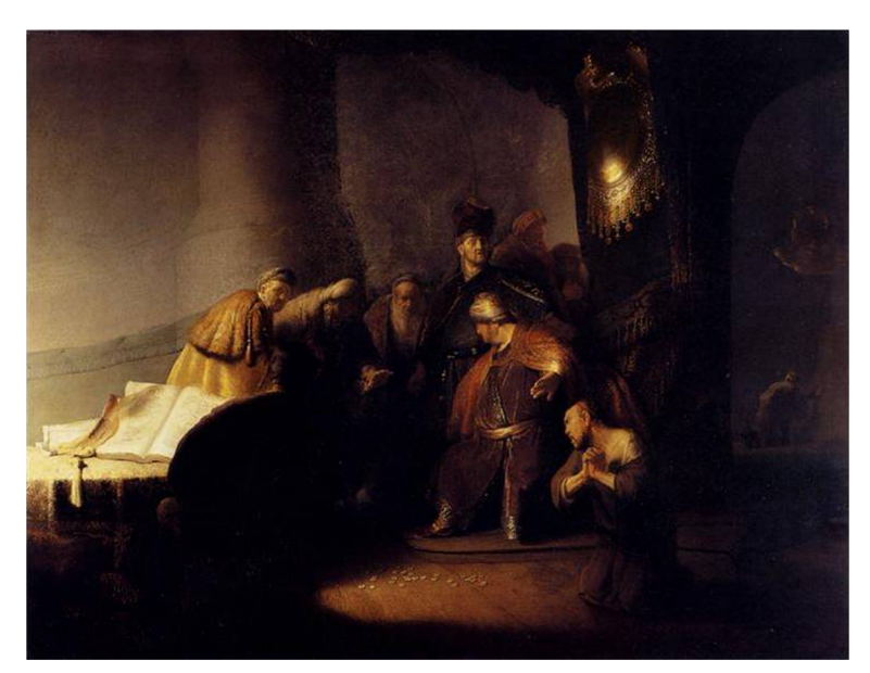
Fig. 3 Rembrandt. Judas Repentant. 1629. Private collection, England

"As if we were by at the doing of the things imagined" encompasses the idea of affectuum vivacitas and of vivida inventio, of the lifelike expression of emotions and of the true-to life-invention (Worp 1891, pp. 125, 128; Sluijter 2014, p. 67; Sluijter 2006, pp. 100–103) systematically articulated in the 17th-century Netherlands. For Huygens Rembrandt gave up conventional beauty for a true-to -life representation. In a beautiful ekphrasis describing Rembrandt's Judas Repentant, (Fig. 3) he writes: "The gesture of this one desperate Judas (to say nothing about all the other amazing figures in this one painting), this one Judas, who raves, wails, begs forgiveness, but without any hope, and in whose face all traces of hope have disappeared; his countenance wild, the hair pulled out, the clothes torn, the arms twisted, the hands pressed together until they bleed; in a blind impulse, he has fallen on his knees, his whole body contorted in pitiful hideousness". (Sluijter 2006, p. 100; Worp 1891, p. 126) Besides, in an explicit exclamation Huygens suggests "let all of Italy and all the miracles of beauty that have survived from antiquity be placed next to this ... This I compare with all beauty that has