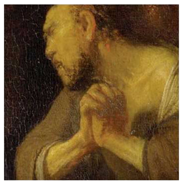
Fig. 7 Rembrandt. Judas Repentant (detail with the figure of Judas)

period about how painting becomes "action at a distance". This is why artworks are expected to elicit reactions in animals, such as dogs barking, as Hoogstraten describes, or in humans, who stretch out their hands from the desire to touch the painted body.