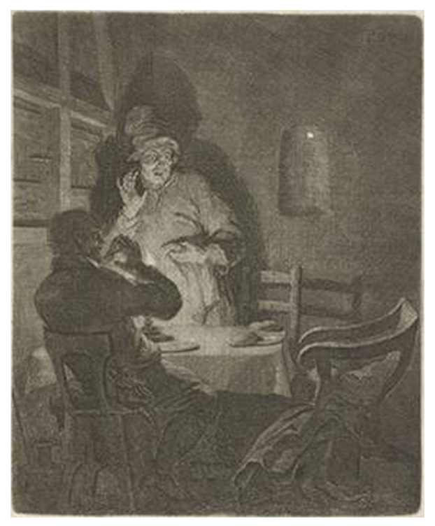
Fig. 19 Arnold Houbraken, after Rembrandt, Supper at Emmaus. 1718–21. Amsterdam, Rijksmuseum

"transported by astonishment and wonder". (Weststeijn 2008, p. 213) Similar traits are to be seen in other scenes of miracle, such as in Christ in the Storm on the Sea of Galilee , (Fig. 20) or of extreme shock, such as The Blinding of Samson , (Fig. 21) probably offered by Rembrandt and refused by Huygens on the grounds of subitus terror . (Slive 1988, pp. 22–23).