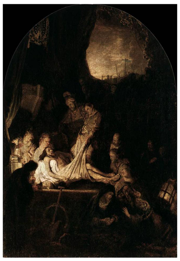
Fig. 1 Rembrandt. The Entombment. 1635–39. Alte Pinakothek, Munich

In this respect, Huygens repeats a commonplace from ancient rhetoric which was taken up by Rembrandt's contemporaries. The commonplace is empathy and it involves both the orator and the audience. Quintilian claims that the orator has to be moved himself if he wants to move his audience. (Weststeijn 2008, p. 183) Horace expresses the same idea in the following terms: "It is not enough that poems should have beauty;