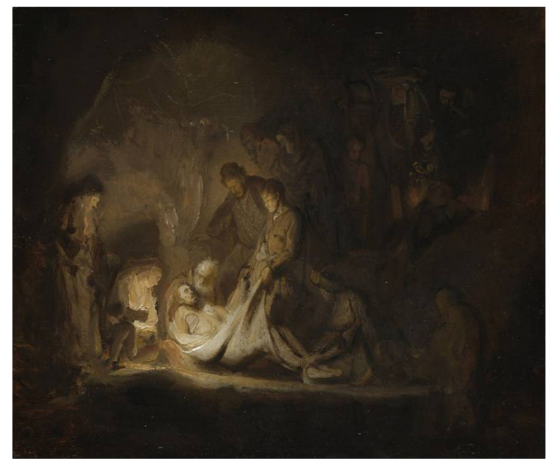
Fig. 12 Rembrandt. The Entombment. ca. 1640. The Hunterian, University of Glasgow, Glasgow

the mid 17th-century Netherlands, such as by Aelbert Cuyp. (Fig. 17) His strong chiaroscuro, quick brushstroke and almost monochromatic palette serve to portray a