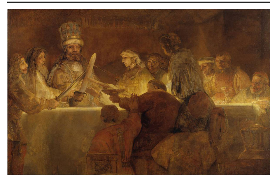
Fig. 14 Rembrandt. The Conspiracy of Claudius Civilis. ca. 1661-62. Nationalmuseum, Stockholm

powerful nature, in Longinus's words, "not the household fire, but those of the heavens, shrouded in darkness", in the Stormy Landscape . Lifelikeness is not necessarily the point here though. As it has been suggested, Dutch landscape painting selectively altered or stereotyped nature for the sake of more powerful emotive effects. (Walsh 1991, pp. 109–110, Goedde 1986, pp. 139–149) Rembrandt's transformation of Adam Elsheimer's Flight into Egypt (Fig. 18) towards a more dramatic note in a less hospitable nature enveloped in a strong chiaroscuro made of thick pigment is interesting in terms of an awe-inspiring response. (Westermann 2000, pp. 188–189)