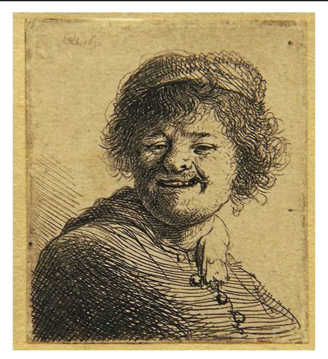
Fig. 6 Rembrandt. Self portrait in a Cap Laughing. 1630. Rijksprentenkabinet, Amsterdam

period about how painting becomes "action at a distance". This is why artworks are expected to elicit reactions in animals, such as dogs barking, as Hoogstraten describes, or in humans, who stretch out their hands from the desire to touch the painted body.