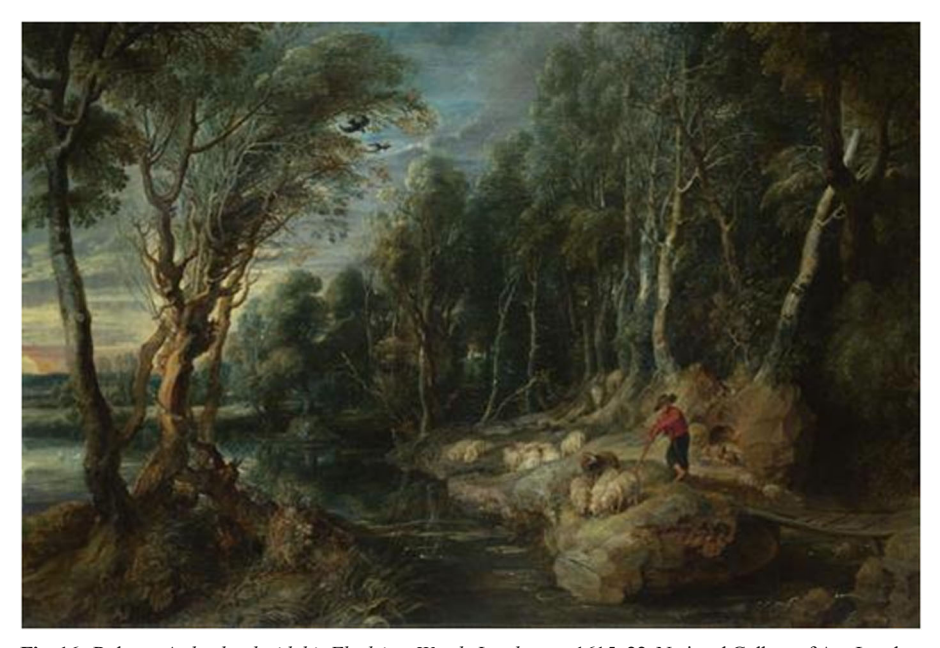
Fig. 16 Rubens. A shepherd with his Flock in a Woody Landscape. 1615–22. National Gallery of Art, London

liveliness that prompt the emotions by underlining the important. They do more. By hiding anecdotal details, by focusing intensely on the coarse faces, they create an unsettling atmosphere, a feeling of imminent threat or fear.