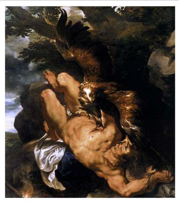
Fig. 23 Rubens and Frans Snyders. Prometheus Bound . ca 1611–12. Philadelphia Museum of Art, Philadelphia