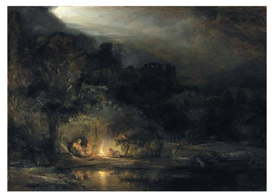
Fig. 13 Rembrandt. Rest on the Flight into Egypt. 1647. National Gallery of Ireland, Dublin

the mid 17th-century Netherlands, such as by Aelbert Cuyp. (Fig. 17) His strong chiaroscuro, quick brushstroke and almost monochromatic palette serve to portray a