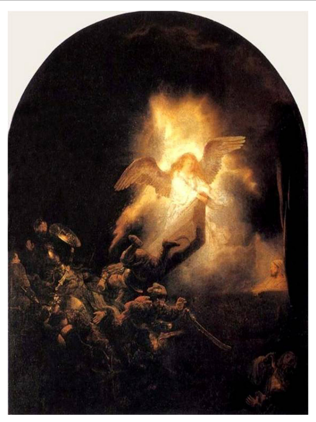
Fig. 2 Rembrandt. The Resurrection. ca. 1639. Alte Pinakothek, Munich