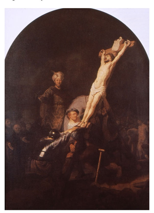
Fig. 4 Rembrandt. The Raising of the Cross. ca. 1633. Alte Pinakothek, Munich

Already in the second decade of the century Gerbrand Adriaensz. Bredero, another Dutch poet and playwright, familiar with the painters of his time, supports the from life ideology by stating "the best painters are those who come closest to life, not those who