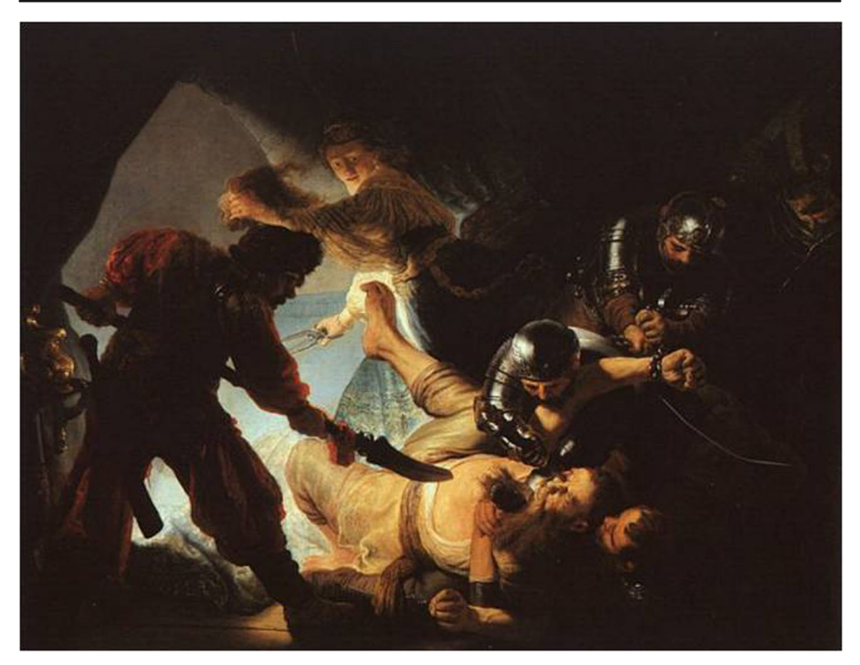
Fig. 21 Rembrandt. The Blinding of Samson. 1636. Städelesches Kunstinsitut, Frankfurt

p. 132) in 1638, it is safe to assume that he may have been familiar with Vondel's mention of the sublime.<sup>6</sup>