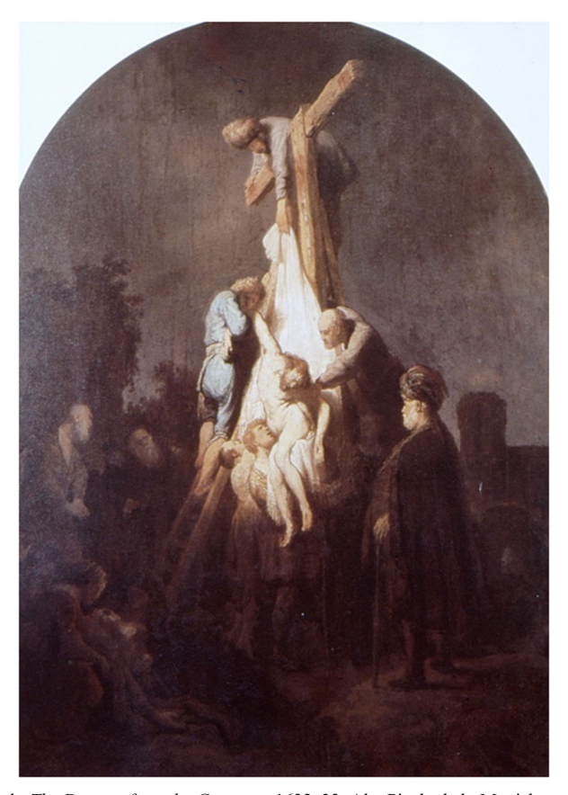
Fig. 5 Rembrandt. The Descent from the Cross. ca. 1632-33. Alte Pinakothek, Munich