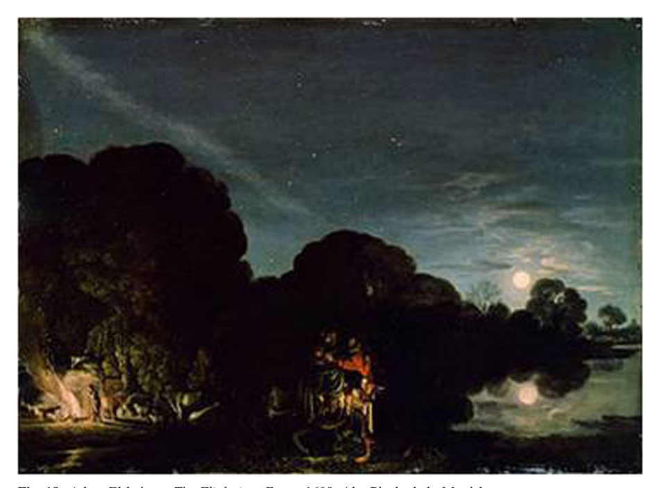
Fig. 18 Adam Elsheimer. The Flight into Egypt. 1609. Alte Pinakothek, Munich

Scenes of sudden apparition, revelation, miracles and shock interestingly share the same characteristics, strong light that highlights forcefully the central theme, broad and thick brushstroke that leaves out anecdotal details and unidealized features. In his early 18th-century biography of Rembrandt, the Dutch Arnold Houbraken seems to write in terms of the sublime referring to Rembrandt's Christ at Emmaus . (Fig. 19) There we read that Rembrandt managed through his "attentive contemplation of the variety of Affects" to show how the disciples at Emmaus, when Christ suddenly appeared, were