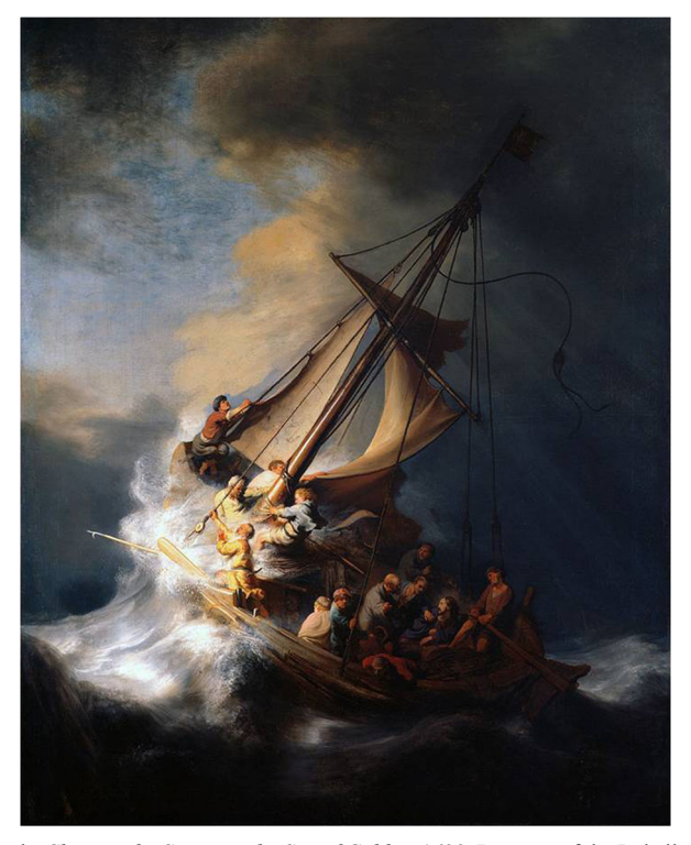
Fig. 20 Rembrandt. Christ in the Storm on the Sea of Galilee. 1633. Property of the Isabella Stewart Gardner Museum, Boston

treatise on painting, De graphice , published in 1650, writes that the works of Protogenes inspired terror. (Weststeijn 2008, p. 155).