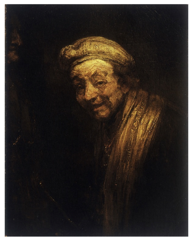
Fig. 24 Rembrandt. Self portrait as Zeuxis. 1665-67. Wallraf-Richartz-Museum, Cologne

masts, topmasts, and the hull of the sea ships, so that splinters fly about the ears of the sailors, who in this disaster predict with tightened lips their last hours. Then again how Neptune, disturbed by the pride of the sea rocks, stirs up the brine, and from the immeasurable depths, comes ashore against them with his triple staff, spattering the highest peaks with foam; and how the ships fall into those breakers." (Blanc 2016, p. 9) In turn, Houbraken's description recalls the sublime effect of Rembrandt's overdramatic land, sea and skies.