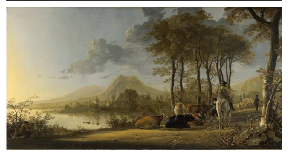
Fig. 17 Aelbert Cuyp. Landscape with Horseman and Peasants. 1658-60. National Gallery of Art, London

Scenes of sudden apparition, revelation, miracles and shock interestingly share the same characteristics, strong light that highlights forcefully the central theme, broad and thick brushstroke that leaves out anecdotal details and unidealized features. In his early 18th-century biography of Rembrandt, the Dutch Arnold Houbraken seems to write in terms of the sublime referring to Rembrandt's Christ at Emmaus . (Fig. 19) There we read that Rembrandt managed through his "attentive contemplation of the variety of Affects" to show how the disciples at Emmaus, when Christ suddenly appeared, were