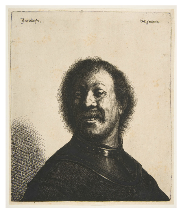
Fig. 10 Jan Gillisz. van Vliet after Rembrandt. Man with a Neckpiece, Laughing. 1632–36. Rijksmuseum, Amsterdam