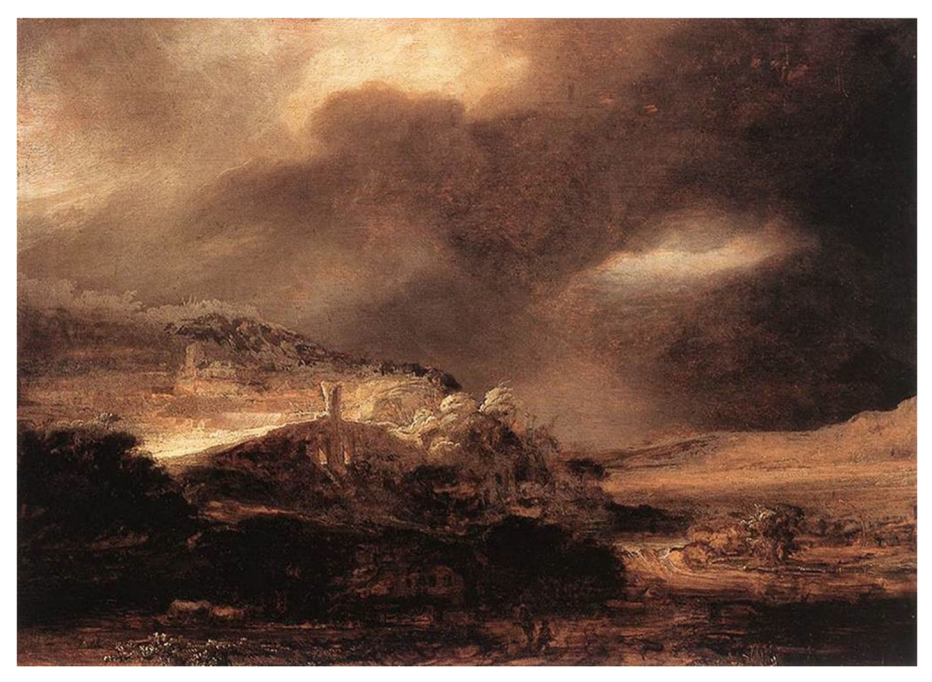
Fig. 15 Rembrandt. Stormy Landscape. 1637–39. Herzog Anton-Ulrich Museum, Braunschweig

liveliness that prompt the emotions by underlining the important. They do more. By hiding anecdotal details, by focusing intensely on the coarse faces, they create an unsettling atmosphere, a feeling of imminent threat or fear.