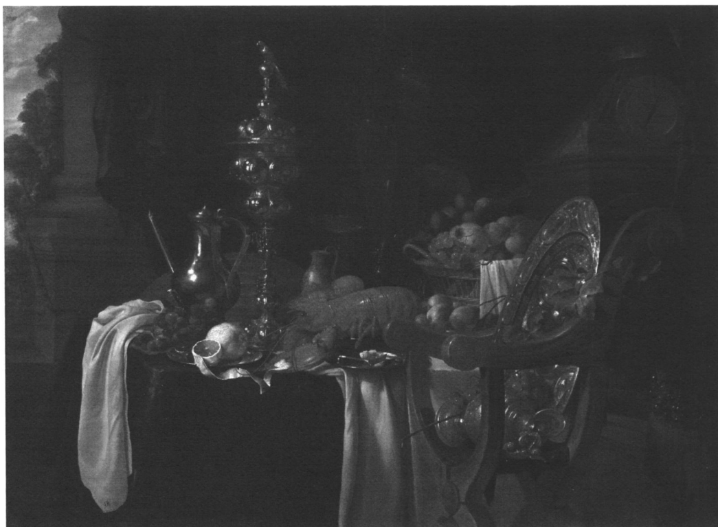
Figure 1. Jan Davidsz. de Heem, Still Life: A Banqueting Scene , probably ca. 1640–41. Oil on canvas, 135.3 x 185.4 cm. New York, The Metropolitan Museum of Art, Charles B. Curtis Fund, 1912.

description and naturalism is illuminating and pertinent to this discussion.