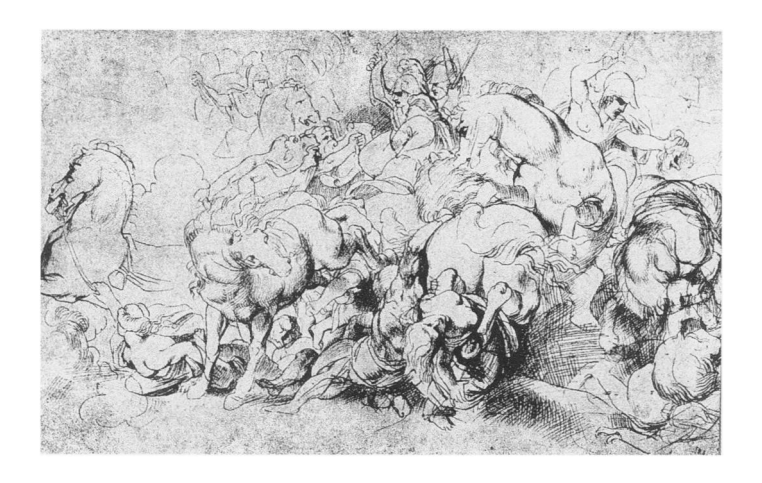
8) Peter Paul Rubens, «The Battle of the Amazons», British Museum, London.