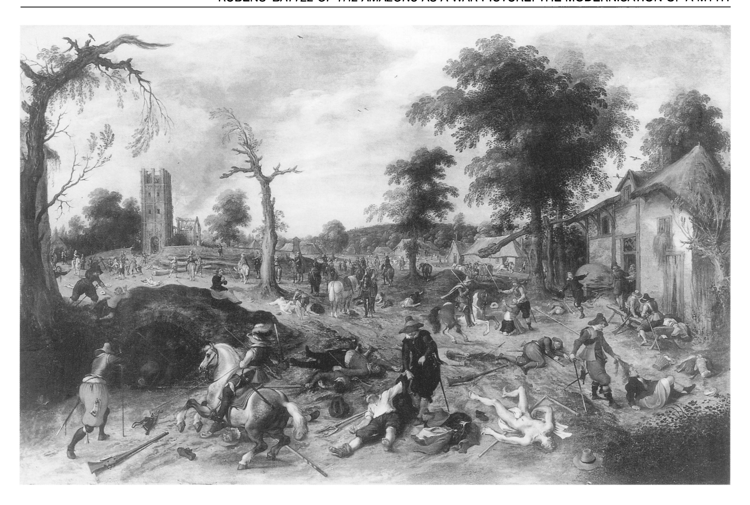
11) Sebastian Vrancx, «The Plundering of the Village Wommelgem», Kunstmuseum im Ehrenhof, Düsseldorf.

the Palazzo Pitti, violence against women without any erotic component as the greatest cruelty. In Rubens' Funeral of Decius Mus, too, woman suffering male violence is shown "as a typical motif in Roman portrayals of triumphal processions." In the iconographic tradition, besides, Renaissance and later art treats the general theme of sexual violence against women, as in the rape of Lucrece, the kidnapping of Persephone, etc. Violent deeds perpetrated by women on the other hand refer, in the iconographic tradition, almost exclusively to the Old Testament theme of the beheading of Holofernes by Judith, and the tale of Jael and Sisera, murders committed by women against men to rescue their people.