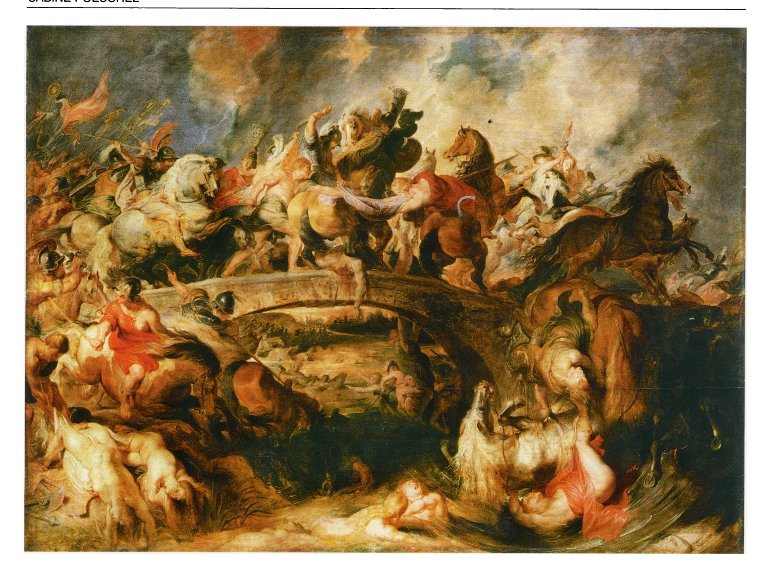
1) Peter Paul Rubens, «The Battle of the Amazons», Alte Pinakothek, Munich.

strengthened by the fact that Rubens employed none of the known literary programmes, but adapted the theme to achieve a novel and subjective portrayal of violence<sup>9</sup>.