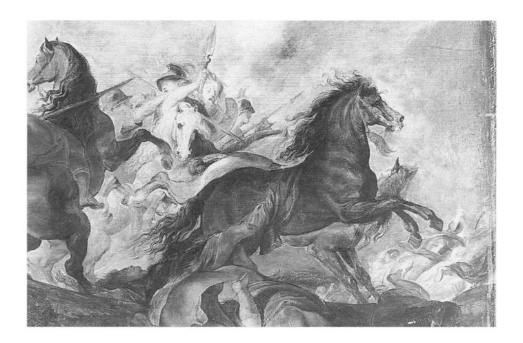
5) Peter Paul Rubens, «The Battle of the Amazons», detail.

important heroes of mythology. They were very frequently presented in literature, shown on vase-paintings, and as statues by the greatest sculptures in antiquity. The best-known figures are from the Sanctuary of Artemis in Ephesus, for example the Amazone Mattei copied from Phidias in the Vatican Museum. According to the myth, some of the Amazons (the two Queens Penthesilea and Hippolyta for instance) were descended from Ares the war-god, but they all venerated the virgin Artemis, goddess of the hunt, whose protection they enjoyed. Both deities patronise conflict and killing, as is emphasised in ancient literature. But while Ares favours raging battle-scenes, Artemis permits only limited and meaningful killing. The figure of the armed woman stands between and integrates the nature of the two deities<sup>14</sup>.