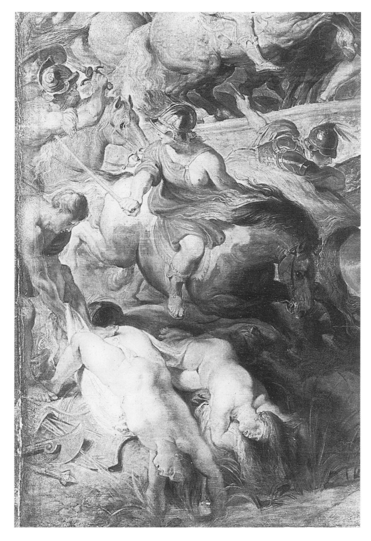
6) Peter Paul Rubens, «The Battle of the Amazons», detail.

This unusual race of women was localised in what is now Anatolia near the river Thermodon, or sometimes in other parts of Asia Minor. The Amazons were led by a queen even braver in war than her companions, and distinguished by a belt. In territories bordering Greece they were involved in conflicts with the heroes of Greek story, principally through their—the Amazons'—alliance with Troy. As a result of this conflict, their history was determined by a major battle which they lost<sup>15</sup>. Nonetheless the Amazons are treated respectfully in ancient literature, and shown fighting with truly martial courage. In the Iliad they are described as the equals of men. Bellerophon slew the "man-equalling Amazons". Demosthenes alludes to their courage in battle<sup>17</sup>. In Plutarch we read in the biography of Theseus: "For the Amazons, not averse to men by their nature,