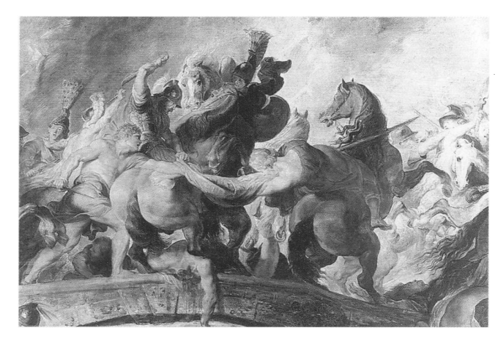
9) Peter Paul Rubens, «The Battle of the Amazons», detail,

Bellerophon defeated the Amazons. Theseus' battle on the river Thermodon does indeed involve the abduction of Antiope, but Rubens' picture presents us, in the central area, not with the abduction, but the death of a woman. The only other remaining context to be considered would be the Herculean labour that took place in the land of the Amazons, but the figure of Hippolyta with the golden girdle—which after all was the objective of the task—is not to be found in Rubens' picture. One might identify Hercules himself in the mounted figure on the bridge far left by the lion-skin over his head, but he remains subordinate and is thus by no means the protagonist of the battle. Besides, it would be untypical for the demigod to be shown on horseback<sup>41</sup>. And finally, the figure need not be Hercules on account of the lionskin on his head, as Rubens provides others too with this heroic attribute. In an early work he portrayed Aeneas with such a lionskin, and in the painting of The Death of Decius Mus two warriors appear at once with this headgear<sup>42</sup>. On the contrary, the mounted man with the lionskin provides further confirmation of Rubens' abandonment of literary as well as pictorial convention.