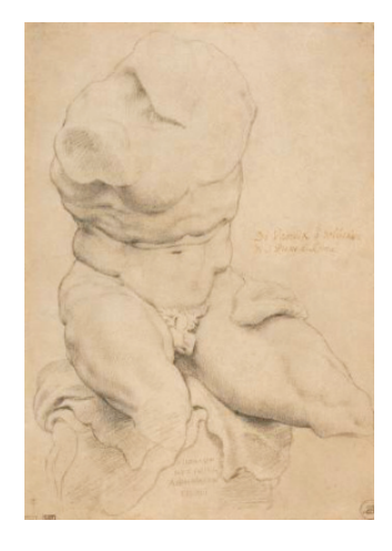
Figure 2. Sir Peter Paul Rubens, Study of the Belvedere Torso (1601, Antwerp, Rubenshuis).

the musculature, motion, and surface detail. In these areas, as in his study of the Laocoön , Rubens used crosshatching and blended his strokes so that they read less as lines than as surfaces of soft, flesh-like texture.