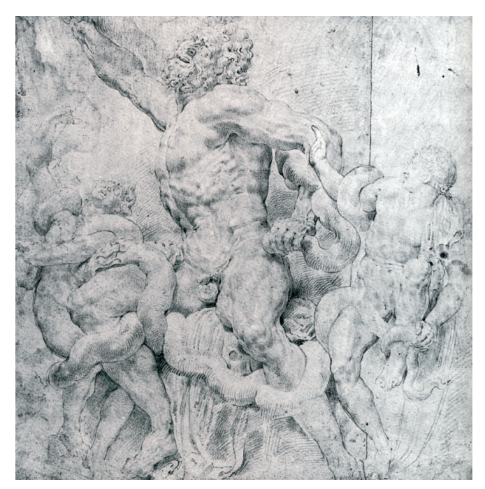
Figure 1. Sir Peter Paul Rubens, Study of the Laocoön (1601, Milan, Biblioteca Ambrosiana).

knowledged his predecessor's contributions to the classical tradition, and aimed to amend Michelangelo's excessive but influential reception of the antique.