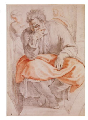
Figure 5. Sir Peter Paul Rubens, Study of Michelangelo's Jeremiah (1601, Paris, Musee du Louvre, Département des Arts Graphiques).

before classical statues. There are, however, significant indicators that the projects were linked in Rubens' mind. For instance, several of the pages on which Rubens made his Sistine drawings share a water-