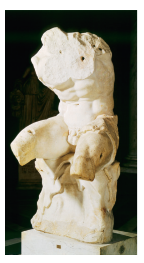
Figure 3. Apollonius, Belvedere Torso (ca. 150 BCE, Vatican City, The Vatican Museum).

When, shortly after his time in Italy, Rubens penned De Imitatione Statuarum, he developed the knowledge gained from these graphic inquiries into a fully articulated, if only partially preserved theory of artistic imitation. His essay, as scholars have noted. owes much to ancient and Renaissance thought, which Rubens notably encountered as part of the circle orbiting the figure of Justus Lipsius