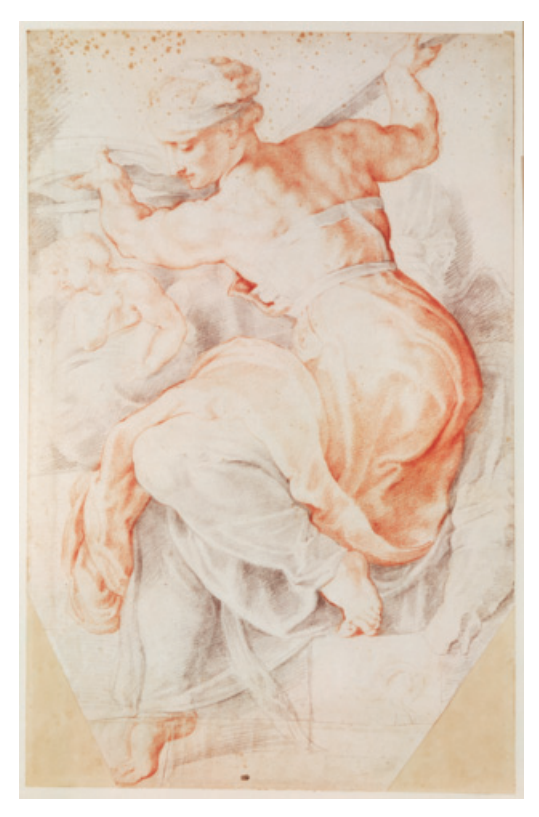
Figure 4. Sir Peter Paul Rubens, Study of Michelangelo's Libyan Sibyl (1601, Paris, Musee du Louvre, Département des Arts Graphiques).

IN THE SAME years that he studied the Laocoön and the Belvedere Torso , Rubens completed over ten drawings after the Sistine Ceiling. The spatial and temporal proximity of these two projects belie the fact that there is, of course, an inherent difference