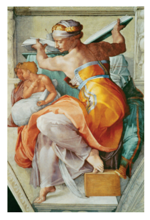
Figure 6. Michelangelo Buonarroti, Libyan Sibyl (1512, Vatican City, The Sistine Chapel).

Michelangelo's figure a softer, fleshier character than what appears in the Chapel.