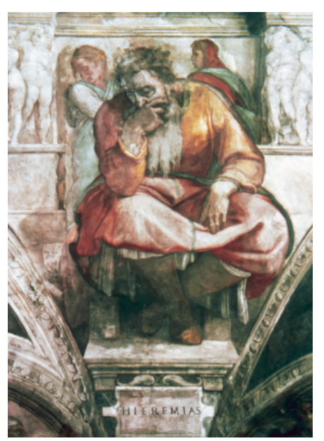
Figure 7. Michelangelo Buonarroti, Ieremiah (1512, Vatican City, The Sistine Chapel).

While it is obvious that Rubens was not working with paint and was therefore at a disadvantage when it came to transcribing the ceiling's bright hues, there can be little doubt that such a