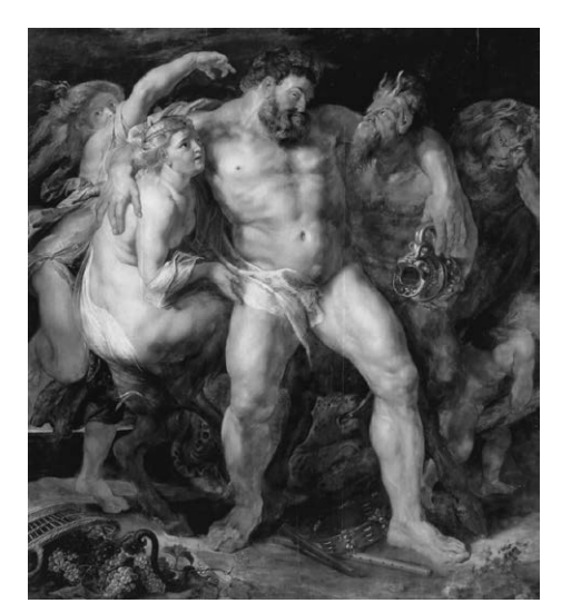
Fig. 1 Peter Paul Rubens, Drunken Hercules, ca. 1613–1615, oil on panel, 220 x 200 cm, Staatliche Kunstsammlungen, Gemäldegalerie Alte Meister, Dresden, inv. no. Gal.-Nr.987.