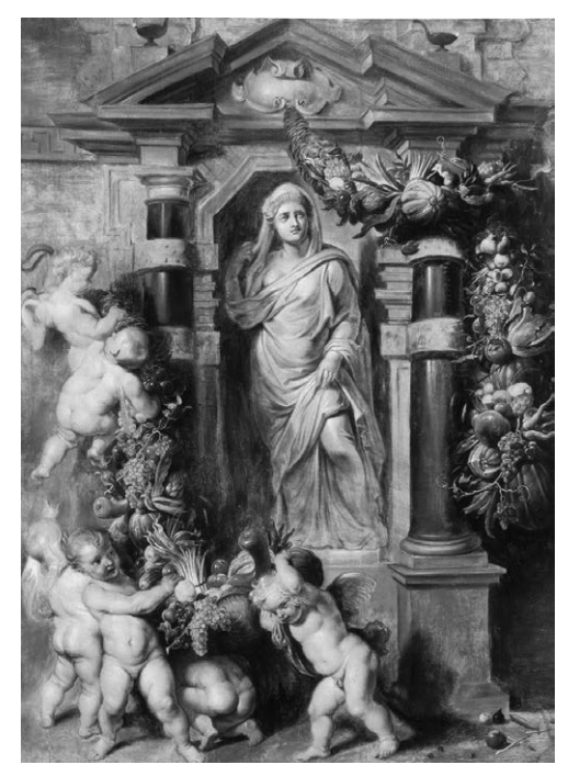
Fig. 4 Peter Paul Rubens, The Homage to Ceres , oil on panel, 91 x 66 cm, Beyeler Collection, Pratteln (Switzerland).

In these cases, the wooden support cannot be used to infer the authorship of these paintings. The open painting technique is also no indicator as it is characteristic of at least two versions, the Swiss version and the one in St Petersburg. The other typical characteristic of Rubens's painting technique, the juxtaposition of extremely open and very dense areas, can also be observed in both paintings equally and is thus of no help. Accordingly, they have been exhibited together in St Petersburg under the title "Two Original Versions." But would Rubens really have made a copy of a painting himself? With an eye on the sociohistorical context this is highly unlikely. Rubens was an exceedingly busy man, who in all probability would not have stooped to producing a copy if that could have been made by an assistant. This again leads to the same unprovable socio-historical argument.