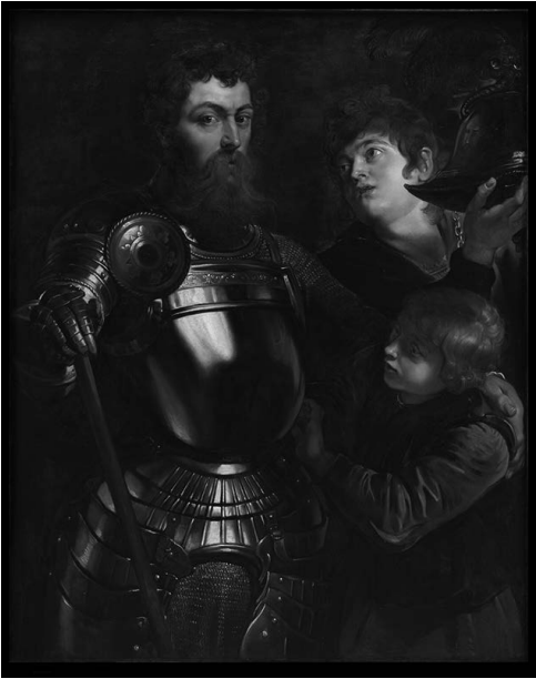
Fig. 6 Peter Paul Rubens, A Warrior Accompanied by Two Pages, ca. 1615–1617, oil on panel, 122.6 x 98.2 cm, Private Collection, New York.