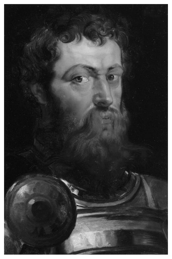
Fig. 8 Peter Paul Rubens, Head Study , ca. 1615–1617, oil on panel, 44.5 x 29.4 cm, Institute of Arts, Detroit, inv. no. 79.15.