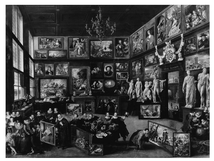
Fig. 7 Willem van Haecht, The Gallery of Cornelis van der Geest, oil on panel, 100 x 130 cm, Rubenshuis, Antwerpen, inv. no. 171.

version then the original? The extant images do not seem to be trimmed. Could one of them be the original? The answer to this is yes. The fact that one of the paintings was part of the van der Geest collection is in itself not proof of Rubens's authorship. And a painting of a different provenance, could at the same time be by Rubens himself. Still, I hold on to the socio-historical argument, as the notion that Rubens would paint two entirely identical versions of the same image seems unlikely. Nevertheless, it is noticeable that the version in Detroit seems more homogeneous in the paint handling, its colours more saturated. Indeed, even Julius Held had compared these paintings in 1982 and concluded that