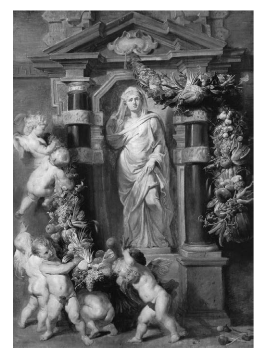
Fig. 3 Peter Paul Rubens, The Homage to Ceres , ca. 1612–1615, oil on panel, 90.3 x 65.5 cm, The State Hermitage Museum, St Petersburg, inv. no. Γ3-504.