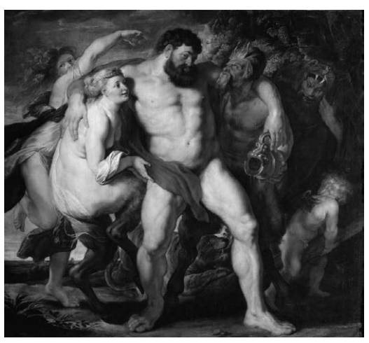
Fig. 2 Peter Paul Rubens, Drunken Hercules , 1613–1615, oil on canvas, 204 x 225 cm, Staatliche Kunstsammlungen, Gemäldegalerie Alte Meister, Dresden, inv. no. Gal.-Nr.957.