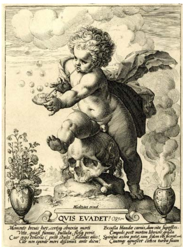
Figure 12. Hendrick Goltzius, Quis Evadet? II (Homo bulla est), 1590-94, After Agostino Carracci. Rijksprentenkabinet, Amsterdam (No. RP-P-OB-10.228).

In a more daring print, Goltzius represented also a panoramic landscape whose lower background illustrates a seascape and cityscape, while the foreground represents the top of a mountain (see Figure 12) (De Grazia, 1984). Here, Goltzius created another Herculean-type of putto who does not rest but eagerly rides on a skull