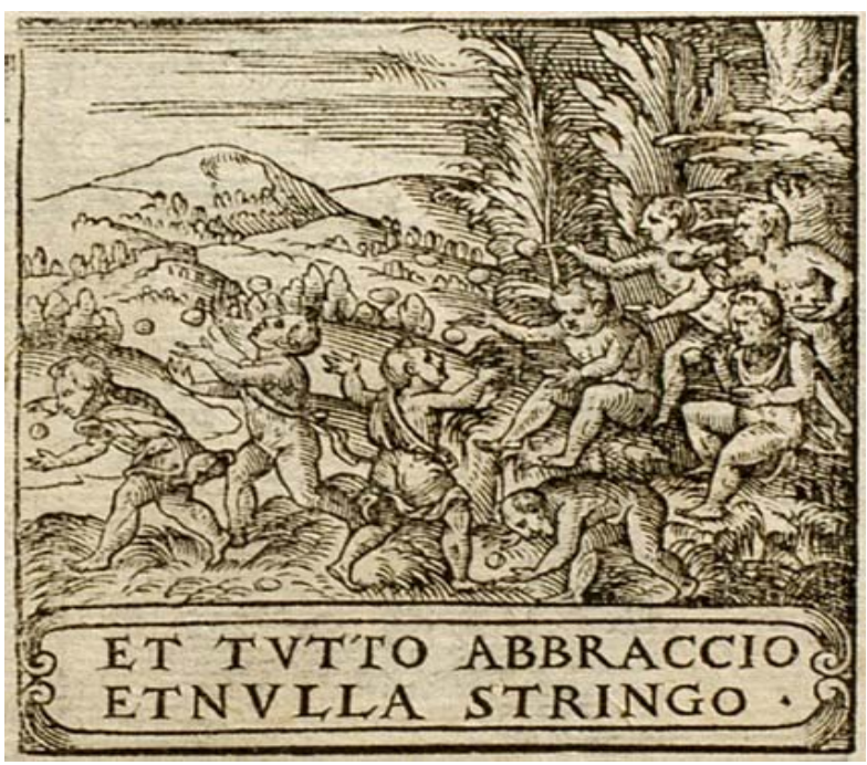
Figure 13. Hadrianus Janius, Emblem XVI, from Medici Emblemata (Antwerp: Christophe Plantin, 1565) (Photo credit: Public domain.Interactive Archive.wikipedia.org).

1994), while the scallop shell as a container of water and soap is a Christian iconographical symbol for purification commonly used in baptismal rituals (Metford, 1983). The scallop shell is also a symbol of pilgrimage referring to the journey of the human soul to achieve eternal salvation while traveling on the Earth (Cooper, 1987).