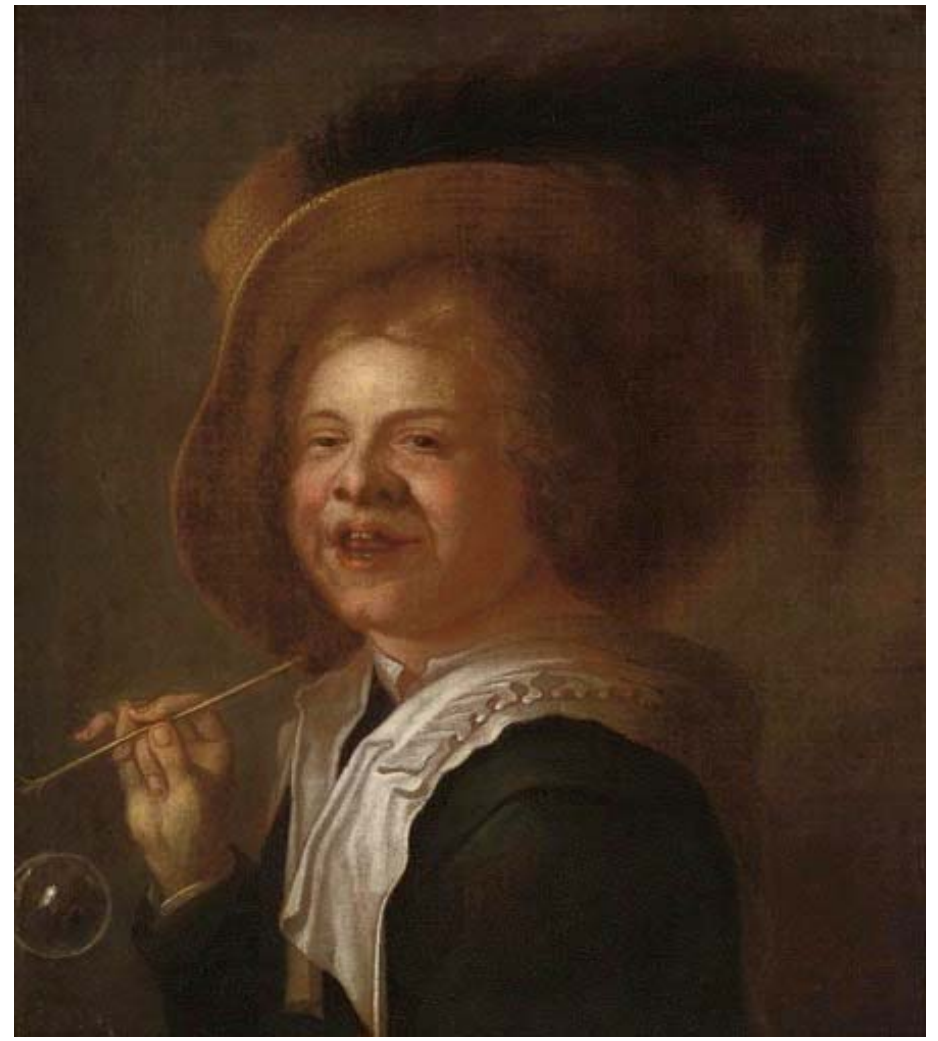
Figure 15. Judith Leyster, A Boy Blowing Bubbles, 1655. Christie's London, 24 March 2009, Lot 94.