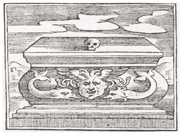
Figure 4. Andrea Alciato, Emblem CLVII, In Mortem Praeproperam (Ultimately Death). Emblemata (Padua: Petro Paulo Tozzi, 1621).

During the 16th century, with few exceptions, complex representations of a skeleton in ars moriendi , totentanz/danse macabre , and the dance of death merged and transformed into a single image, the skull. From then on, the image of the skull with all types of modifications and additional attributes makes it solo appearance as a memento mori (remember that you have to die) or vanitas (emptiness) symbol, directing the viewer to the end of life and away from its vanities or futilities. This imagery is noted by the Italian humanist, lawyer, and emblematist par excellence, Andrea Alciato (1492-1550), in his Emblem CLVII, In Mortem Praeproperam (Ultimately Death), which represents death with a skull instead of a skeleton, placed on a sarcophagus (see Figure 4) (Alciato, 1591; 1621). Alciato's Emblemata became a popular source for moral connotations in European humanistic and artistic circles (Alciato, 1591).