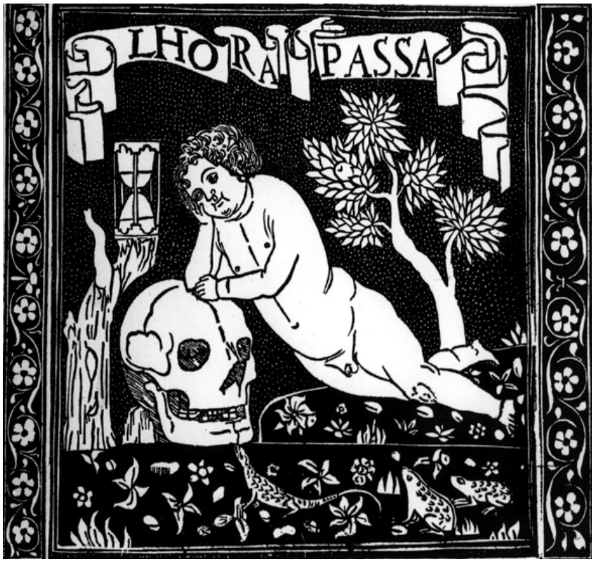
Figure 9. Anonymous, Italian Renaissance woodcut, L'Hora Passa, 1490. Bibliothèque Nationale, Paris.

Imageries of Homo bulla est (man [the individual] is a bubble) are depictions of an open landscape where a putto or a naked youth rests on a skull while blowing soap bubbles. This imagery is commonly illustrated in European emblematic books and prints of the 16th and 17th centuries (Sutton, 2012; Cheney, 1992). This essay briefly examines the complex symbolism of air, as an ephemeral state, as a reference to the terrestrial passing of life ( l'hora passa ). In an anonymous Italian Renaissance woodcut, L'Hora Passa (Time Passes), 1490, at the Bibliothèque Nationale in Paris (see Figure 9), the motto l'hora passa , inscribed in a scroll at the top of the imagery, illustrates this concept (Janson, 1937)<sup>7</sup>. The scene represents, perhaps for the first time in Italian Renaissance art, the depiction of an hourglass with a wingless putto. The naked youth intensely gazes at the hourglass while resting on a large skull. He is meditating on the passing of time in a landscape surrounded with blooming and dead trees, scattered flowers, and insects—frogs and lizards (Janson, 1937; Seznec, 1938; Labno, 2016)<sup>8</sup>.