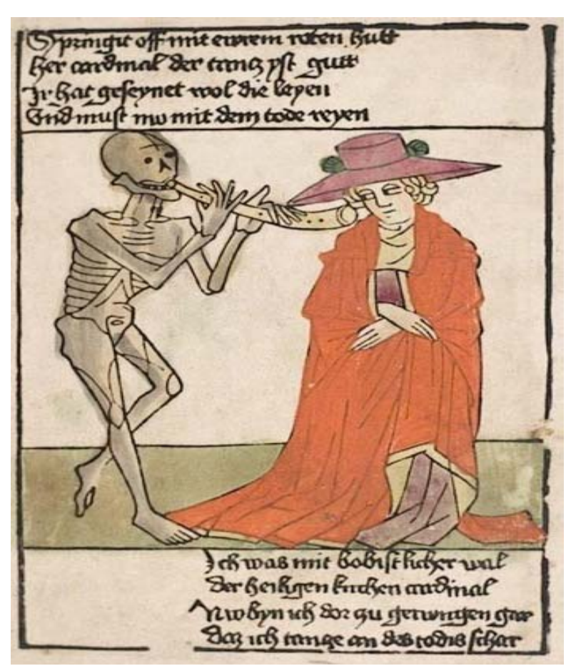
Figure 1. Totentanz, 1455, blockbook from the Codex Platinus Germanicus 438 (132r) at the University of Heidelberg, Germany (Photo credit: Public domain.commons.wikimedia.org).

The concept of pairing living figures with death continues throughout the 16th century and into the 17th in Europe.