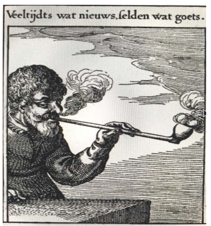
Figure 14. Roemer Visscher, Emblem X, from Sinnepoppen (Amsterdam: Claes Jansz Visscher, 1614).