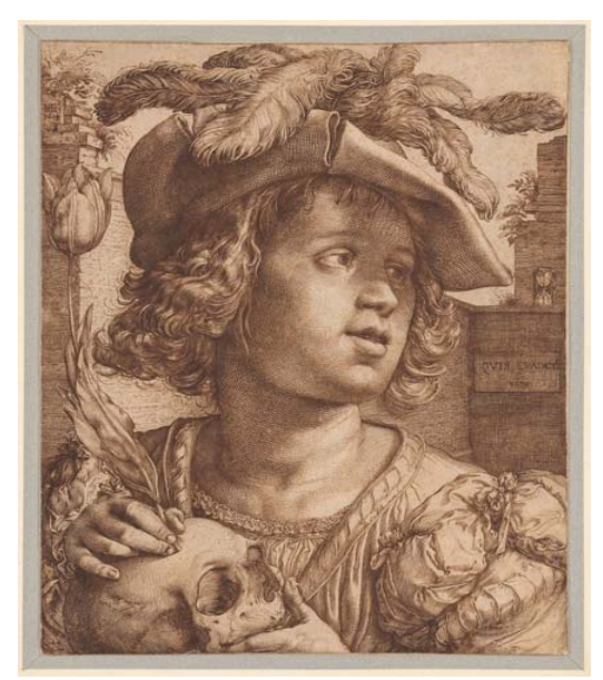
Figure 7. Hendrick Goltzius, Man Holding a Skull and a Tulip, 1614, drawing. Pierpont Morgan Library, NY. Photo credit: Pierpont Morgan Library, New York (Inv. III.145). Download image: 128202v–0001.jpg.