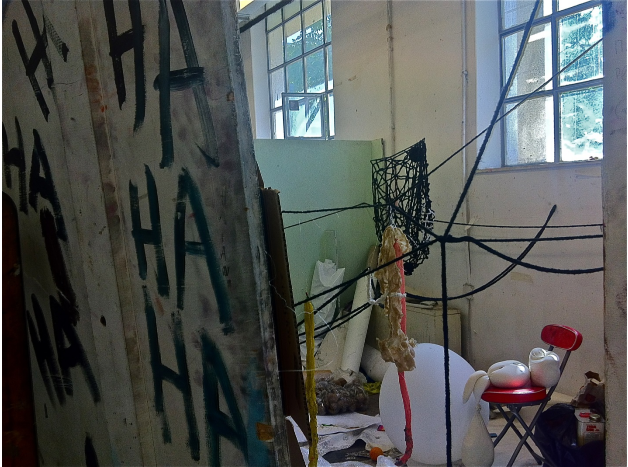
ainting Lab