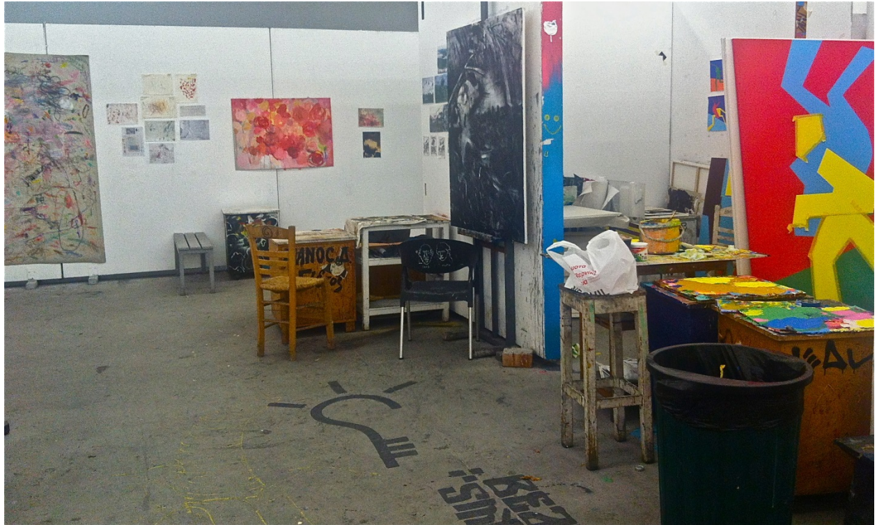
1 st Painting Lab, ASFA