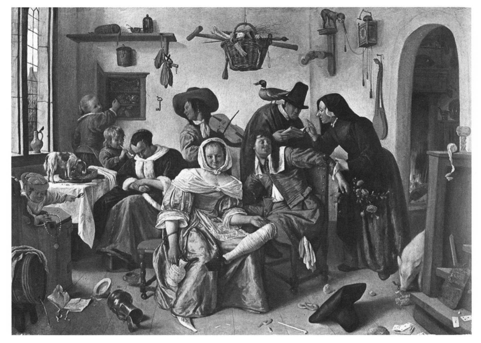
Fig. 3 Jan Steen, In Luxury, Look Out, 1663, Kunsthistorisches Museum, Vienna

The practice of assembling 'visibly accessible meanings' in the same pictorial space was a characteristic of the Netherlandish tradition.<sup>3</sup> For example, Gerrit Dou - Van Mieris's teacher - constructs an ambitious composition about deception in The Quack. Dou depicts stereotypical peasants and labourers acting out various proverbs about folly and deceit in a meticulously described yet ultimately fantastical setting. Van Mieris's acquaintance Jan Steen likewise creates intricate compositions filled with symbolic motifs, of which In Luxury, Look Out can serve as an example (Fig. 3). Even though Steen has carefully rendered the appearance of each object and figure, the composition is a highly theatrical combination of enacted proverbs. Artists accumulate signifying elements in their paintings, but they do not always do so in a way that preserves narrative or even spatial coherence. Following traditional practice in using the additive approach to composition, Van Mieris has constructed a peculiar and conspicuously artificial image in The Cloth Shop by combining signifying motifs commonly found in different subjects.