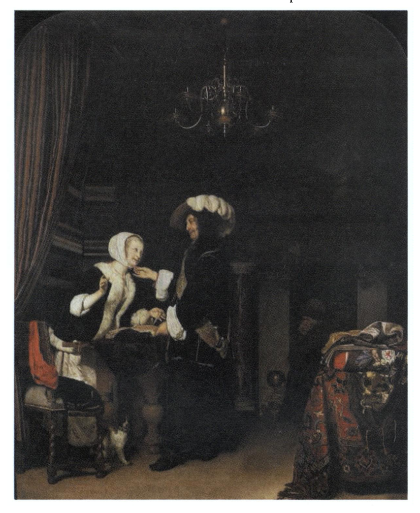
Fig. 1 Frans van Mieris, The Cloth Shop , 1660, Kunsthistorisches Museum, Vienna