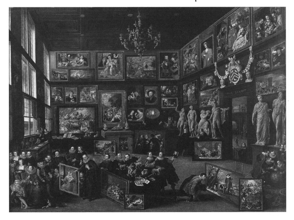
Fig. 4 Willem van Haecht, The Cabinet of Cornelis van der Gheest , 1628, Rubenshuis, Antwerp

Haecht's Cabinet of Cornelis van der Gheest (Fig. 4) or David Teniers's representations of the Italian paintings in Leopold Wilhelm's possession, artists were known to alter the dimensions of individual pieces to create a pleasing arrangement in a palatial setting.<sup>24</sup> On the other hand, because they represent the ideal, gallery pictures help identify the artists whose works were coveted by collectors in the period. Moreover, gallery pictures offer insights into the practices that took place within substantial European collections. Paintings by Van Haecht and Teniers, for example, show figures gesticulating while looking at and talking about specific objects. Collections are thus presented as social spaces where informed viewers inspected, admired, and conversed about art.