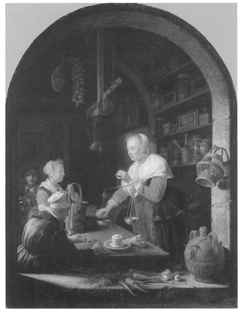
Fig. 5 Gerrit Dou, The Grocer's Shop , 1647, Musée du Louvre, Paris

seen through a monumental stone window. In Dou's distinctive scheme, brightly illuminated figures of the vendor and customers standing just behind the window are juxtaposed with other figures and objects deep in pictorial space (Fig. 5). A diverse range of goods is either neatly placed on wall shelves