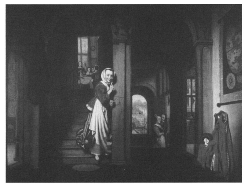
Fig. 7 Nicolaes Maes, The Eavesdropper, 1657