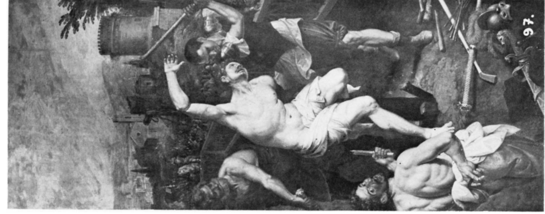
St Sebastian beaten with Rods, by A. Francken. Panel, 283 by 112 cm. (Koninklijk Museum voor Schone Kunsten, Antwerp). 6