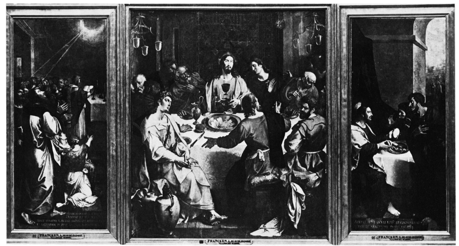
12. Triptych of the Holy Sacrament, by A. Francken. Panel, centre, 275 by 240 cm.; wings, 255 by 115 cm. (Koninklijk Museum voor Schone Kunsten, Antwerp).