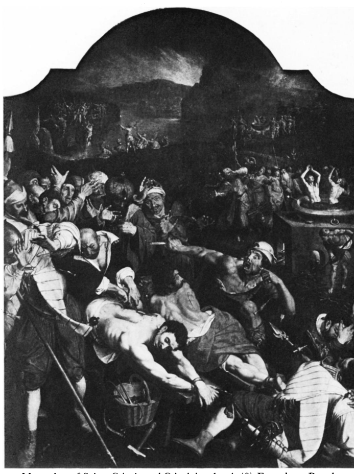
2. Martyrdom of Saints Crispin and Crispinian, by A.(?) Francken. Panel, 271 by 217 cm. (Koninklijk Museum voor Schone Kunsten, Antwerp).