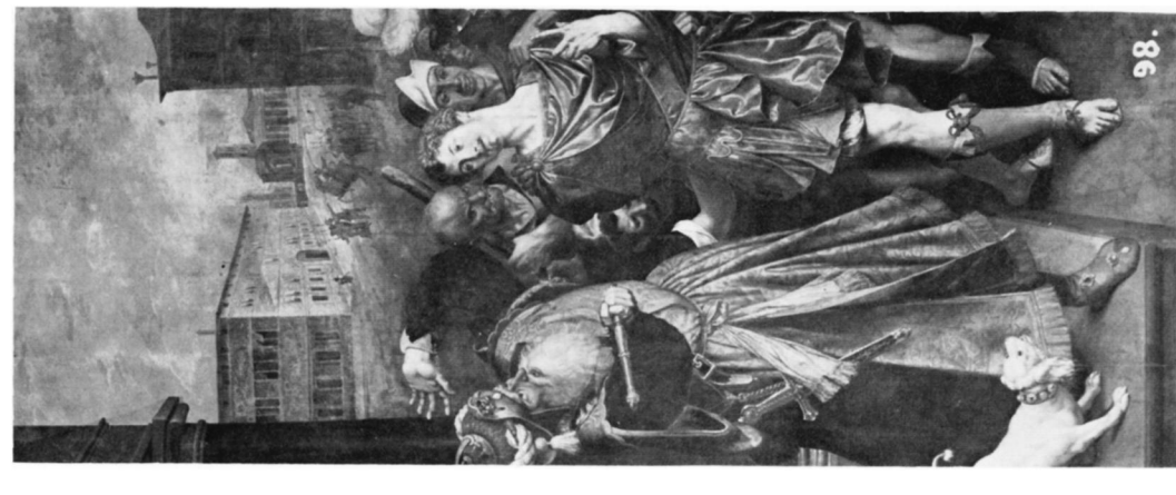
8. Diocletian Condemning St Sebastian, by A. Francken. Panel, 283 by 112 cm. (Koninklijk Museum voor Schone Kunsten, Antwerp).