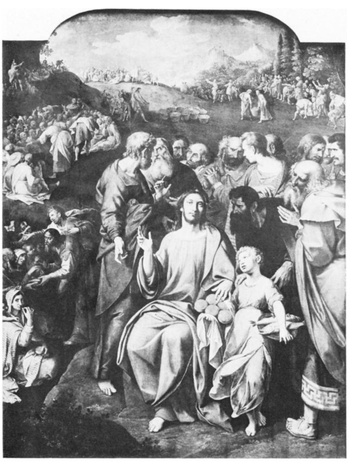
13. The Miracle of the Loaves and Fishes, by A. Francken. Panel, 280 by 212 cm. (Koninklijk Museum voor Schone Kunsten, Antwerp).