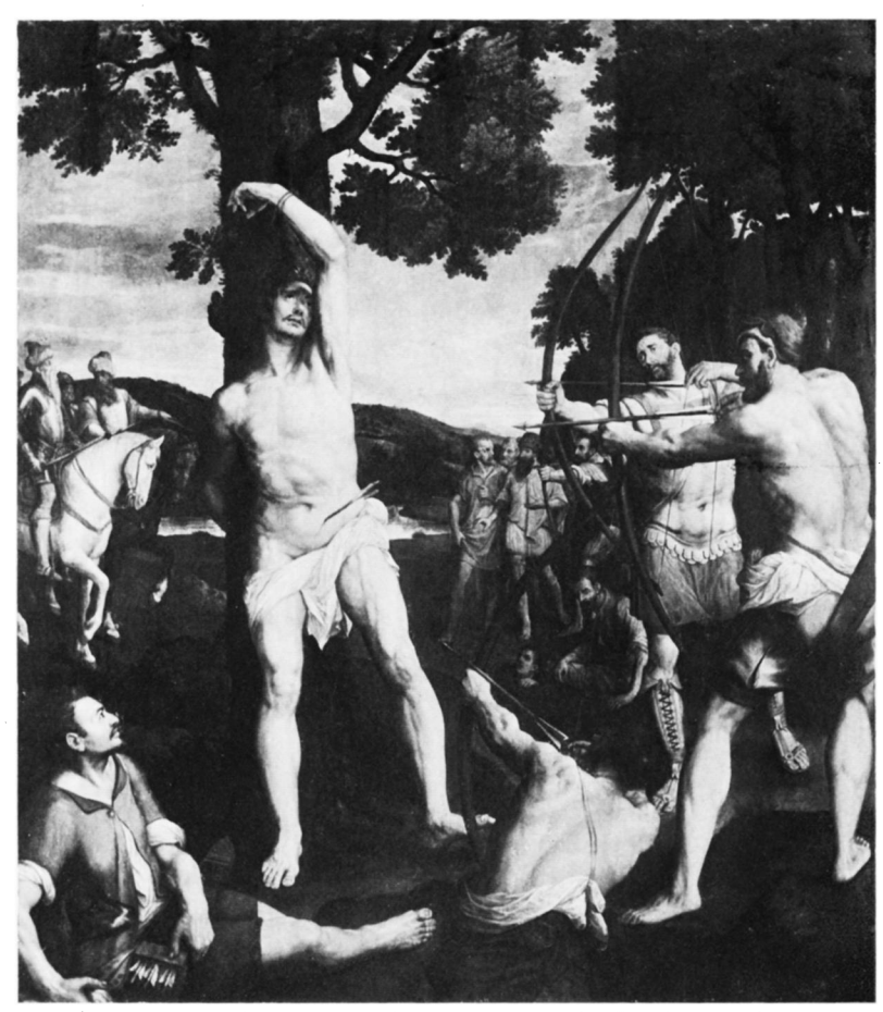
11. The Martyrdom of St Sebastian, by Michael Coxcie. Panel, 267·2 by 235 cm. (Koninklijk Museum voor Schone Kunsten, Antwerp).