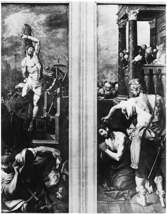
10. Scenes from the Martyrdom of St George, by A. Francken. Panel, each 270 by 90 cm. (Koninklijk Museum voor Schone Kunsten, Antwerp).