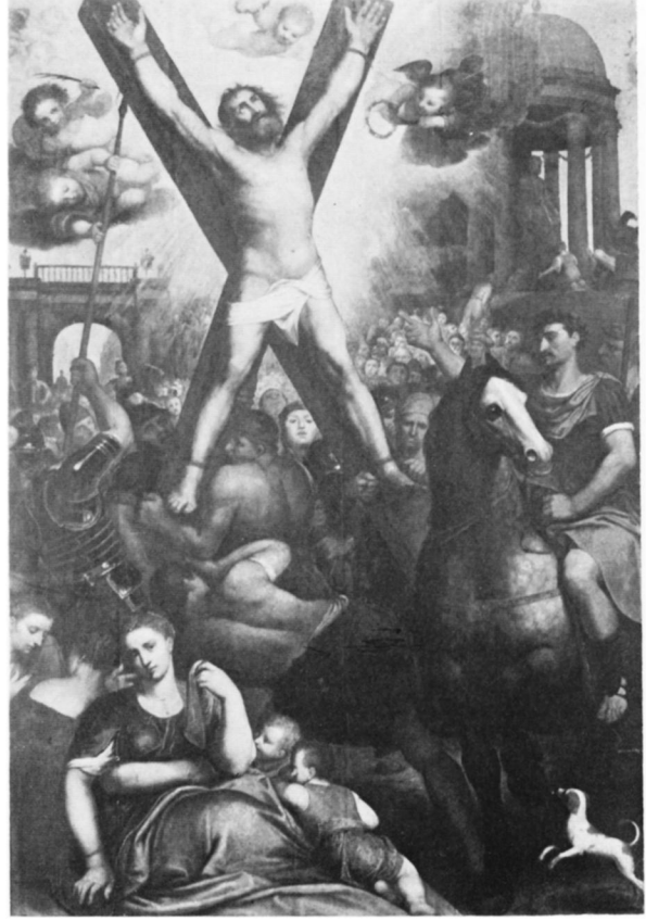
16. The Martyrdom of St Andrew, by Otto van Veen. Panel, 437 by 287 cm. (St Andrew, Antwerp).