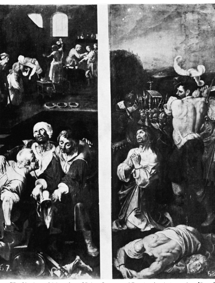
3. The Charity and Martydom of Saints Cosmas and Damian, by A. Francken. Panel, each 237 by 89 cm. (Koninklijk Museum Voor Schone Kunsten, Antwerp).