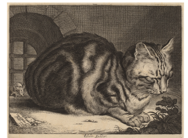
Fig 8. Cornelis Visscher, The Large Cat , ca. 1657, engraving on laid paper, 22.1 x 31.5 cm, National Gallery of Art, Washington D.C., Ailsa Mellon Bruce Fund, 1995.72.1