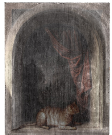
Fig 3. X-radiograph of Cat Crouching on the Ledge of an Artist's Atelier , GD-108, with X-ray superimposed in registration with the visual image (composite: John Twilley)