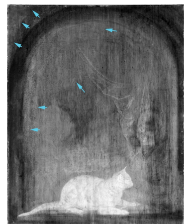
Fig 6. Infrared photograph of Cat Crouching on the Ledge of an Artist's Atelier , GD-108