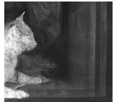
Fig 5. Detail of infrared reflectogram of Cat Crouching on the Ledge of an Artist's Atelier , GD-108, showing silhouette of what appears to be a mousetrap in the lower right corner