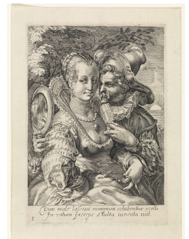
Fig 9. Jan Saenredam, after Hendrick Goltzius, Sight , ca. 1595–96, engraving, 177 x 124 mm, Rijksprentenkabinet, Rijksmuseum, Amsterdam, RP-P-1884-A-7717