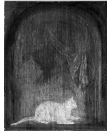
Fig 7. Infrared photograph superimposed on X-radiograph with inverted density grayscale of Cat Crouching on the Ledge of an Artist's Atelier , GD-108

The present work is one of three known paintings by Dou featuring animals. [21] King Augustus II acquired Cat Crouching on the Ledge of an Artist's Atelier in the early eighteenth century for the imperial house collections of the Royal Palace in Dresden, where it remained, with nineteen other autograph paintings by Dou, until the third decade of the twentieth century. [22] In the 1920s the Gemäldegalerie in Dresden de-accessioned the painting, and handed the work over to the former Royal