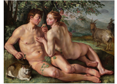
Fig 10. Hendrick Goltzius, Fall of Man , 1616, oil on canvas, 104.5 x 138.4 cm, National Gallery of Art, Washington D.C., Patrons' Permanent Fund, 1996.34.1