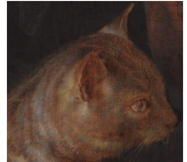
Fig 1. Detail of cat's head, Cat Crouching on the Ledge of an Artist's Atelier , GD-108