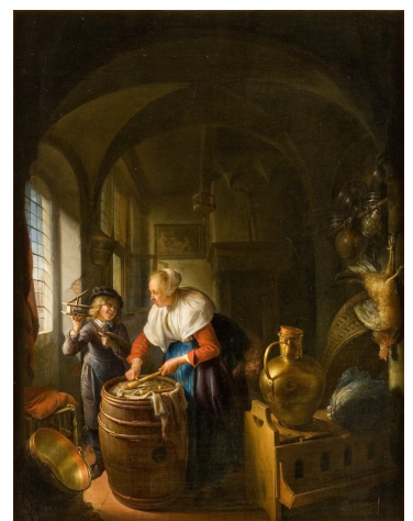
Fig 12. Gerrit Dou, The Mousetrap , ca. 1650, oil on panel, 47 x 36 cm, Musée Fabre, Montpellier, © Musée Fabre — Montpellier Agglomération / cliché F. Jaulmes