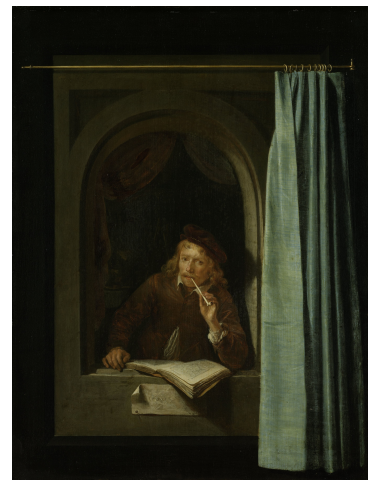
Fig 11. Gerrit Dou, Painter with Pipe and Book , ca. 1645, oil on panel, 48 x 37 cm, Rijksmuseum, Amsterdam, SK-A-86