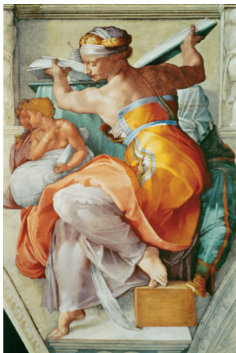
Figure 6. Michelangelo Buonarroti, Libyan Sibyl (1512, Vatican City, The Sistine Chapel; Photo Credit: Erich Lessing / Art Resource, NY).

Michelangelo's figure a softer, fleshier character than what appears in the Chapel.