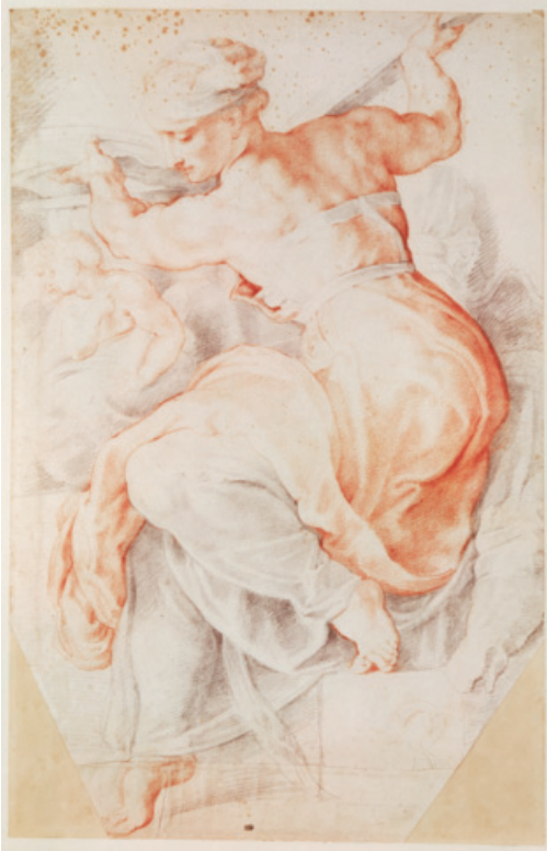
Figure 4. Sir Peter Paul Rubens, Study of Michelangelo's Libyan Sibyl (1601, Paris, Musée du Louvre, Département des Arts Graphiques).

IN THE SAME years that he studied the Laocoön and the Belvedere Torso , Rubens completed over ten drawings after the Sistine Ceiling. The spatial and temporal proximity of these two projects belie the fact that there is, of course, an inherent difference