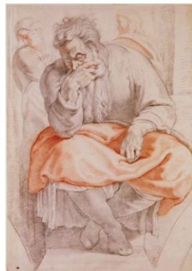
Figure 5. Sir Peter Paul Rubens, Study of Michelangelo's Jeremiah (1601, Paris, Musée du Louvre, Département des Arts Graphiques).

between them. When studying Michelangelo's frescos, Rubens was not studying sculpture. He could not work around the figures or experience them with the same presence, mobility, and freedom that he enjoyed when standing before classical statues. There are, however, significant indicators that the projects were linked in Rubens' mind. For instance, several of the pages on which Rubens made his Sistine drawings share a water-