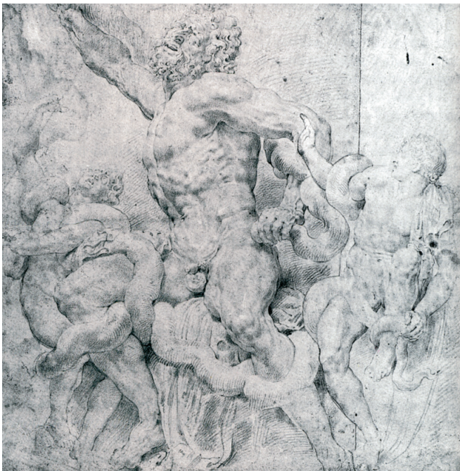
Figure 1. Sir Peter Paul Rubens, Study of the Laocoön (1601, Milan, Biblioteca Ambrosiana).

knowledged his predecessor’s contributions to the classical tradition, and aimed to amend Michelangelo’s excessive but influential reception of the antique.