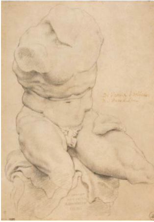
Figure 2. Sir Peter Paul Rubens, Study of the Belvedere Torso (1601, Antwerp, Rubenshuis).

the musculature, motion, and surface detail. In these areas, as in his study of the Laocoön , Rubens used crosshatching and blended his strokes so that they read less as lines than as surfaces of soft, flesh-like texture.