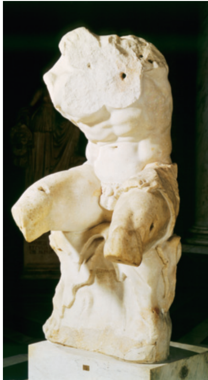
Figure 3. Apollonius, Belvedere Torso (ca. 150 BCE, Vatican City, The Vatican Museum).

When, shortly after his time in Italy, Rubens penned De Imitatione Statuarum , he developed the knowledge gained from these graphic inquiries into a fully articulated, if only partially preserved theory of artistic imitation. His essay, as scholars have noted, owes much to ancient and Renaissance thought, which Rubens notably encountered as part of the circle orbiting the figure of Justus Lipsius