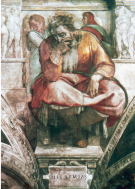
Figure 7. Michelangelo Buonarroti, Jeremiah (1512, Vatican City, The Sistine Chapel).

While it is obvious that Rubens was not working with paint and was therefore at a disadvantage when it came to transcribing the ceiling's bright hues, there can be little doubt that such a gifted draftsman could have suggested color—if he wanted. In fact, he often retouched drawings after completing them, returning to them multiple times and combining different media, including colored chalks and pigments, in order to achieve the effects he desired. In terms of the Sistine studies, then, the logical conclusion is that Rubens was not interested in Michelangelo's cangiantismo , for he made no effort to reproduce it while he was in the chapel or after he left. Instead, Rubens used rustic earth tones to breathe life into Michelangelo's figures and to cleanse them of the “smell of stone.”