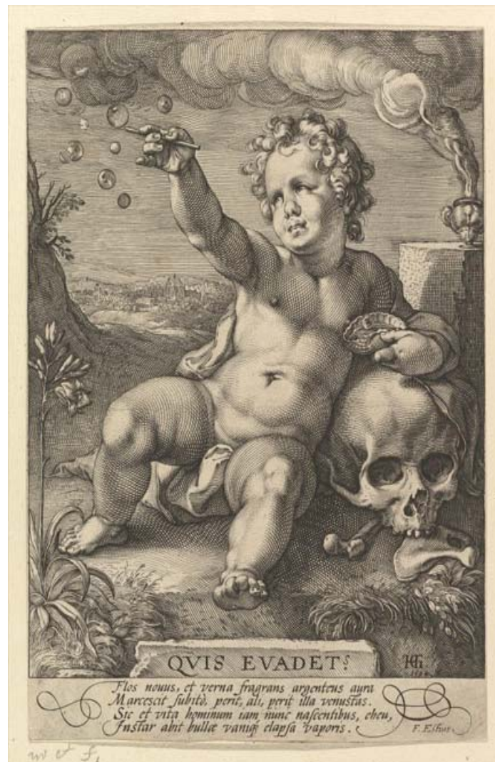
Figure 11. Hendrick Goltzius, Quis Evadet? I, 1594. Allegory of Transience (Homo bulla est). Metropolitan Museum of Art, New York (51.501.4929). The Elisha Whittelsey Collection, The Elisha Whittelsey Fund, 1951.