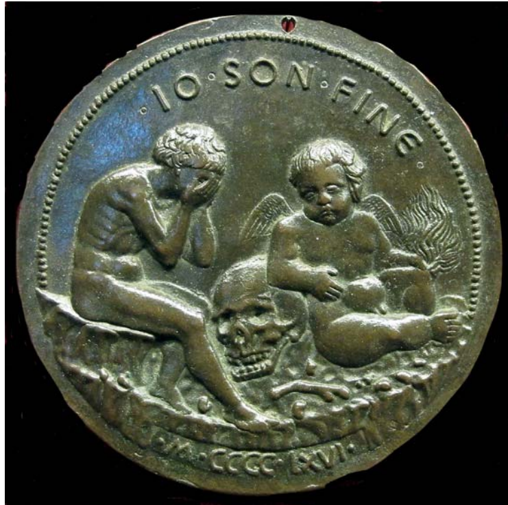
Figure 10. Giovanni Boldù, “ Io Son Fine ”, medal verso from Roman Emperor Caracalla, 1490. Victoria and Albert Museum, London.