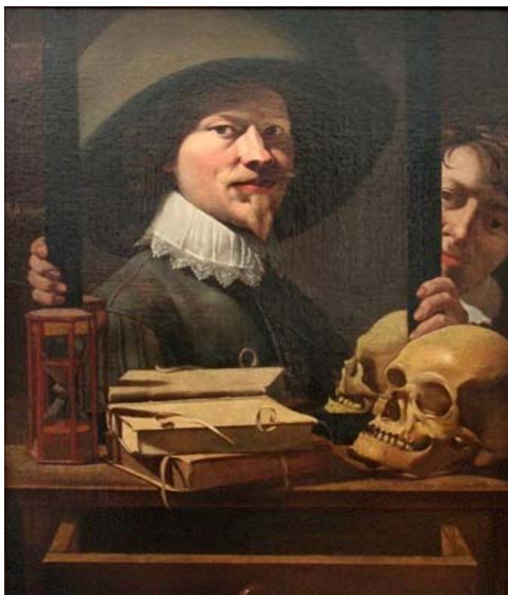
Figure 8. Antoine van Steenwinkel, Vanitas Portrait of the Painter , 1680. The Royal Museum of Fine Arts, Antwerp, Belgium (Photo credit: Public domain.commons.wikimedia.org).