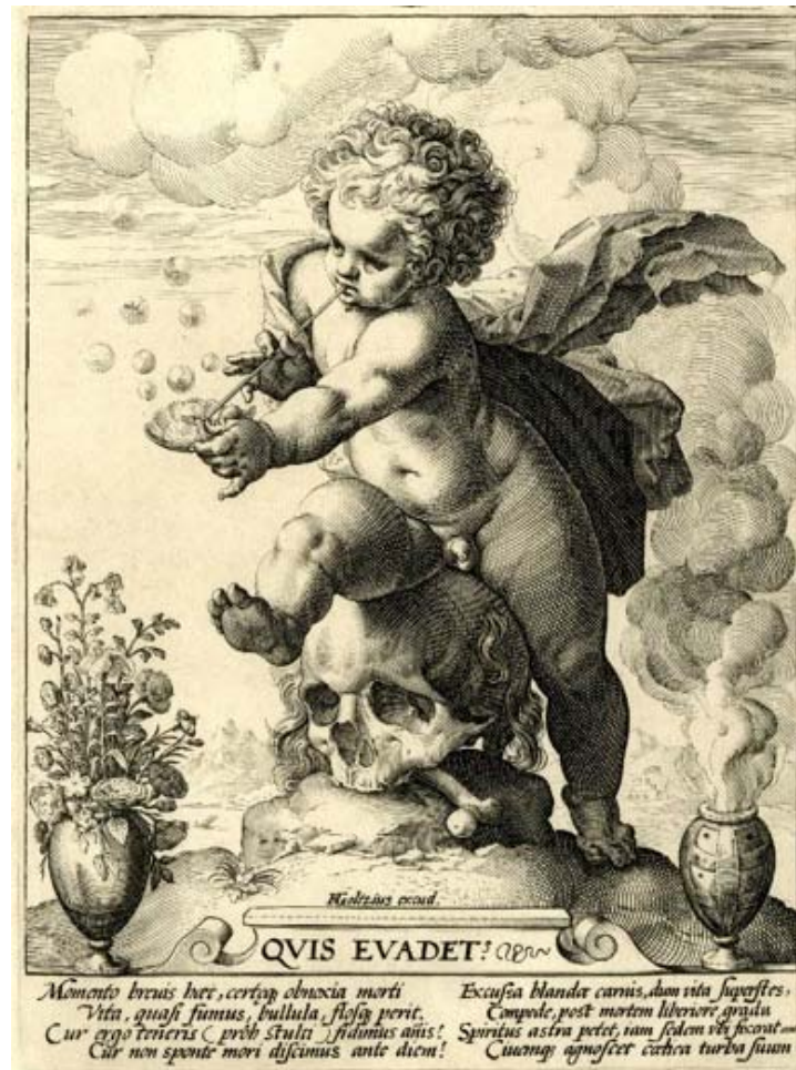
Figure 12. Hendrick Goltzius, Quis Evadet? II (Homo bulla est) , 1590-94, After Agostino Carracci. Rijksprentenkabinet, Amsterdam (No. RP-P-OB-10.228).

In a more daring print, Goltzius represented also a panoramic landscape whose lower background illustrates a seascape and cityscape, while the foreground represents the top of a mountain (see Figure 12) (De Grazia, 1984). 13 Here, Goltzius created another Herculean-type of putto who does not rest but eagerly rides on a skull