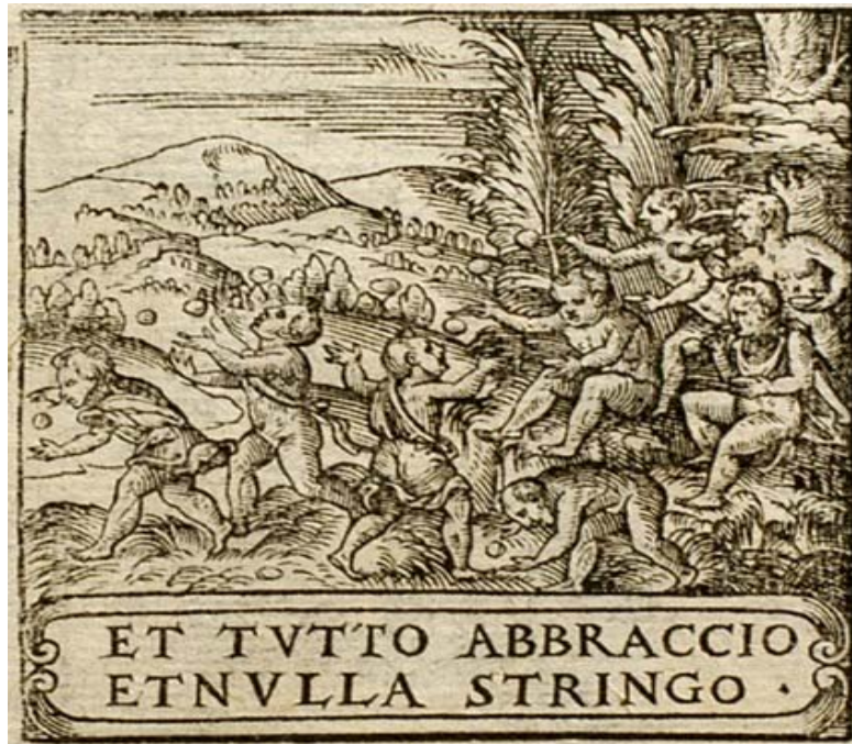
Figure 13. Hadrianus Janius, Emblem XVI, from Medici Emblemata (Antwerp: Christophe Plantin, 1565) (Photo credit: Public domain.Interactive Archive.wikipedia.org).

1994), while the scallop shell as a container of water and soap is a Christian iconographical symbol for purification commonly used in baptismal rituals (Metford, 1983). The scallop shell is also a symbol of pilgrimage referring to the journey of the human soul to achieve eternal salvation while traveling on the Earth (Cooper, 1987).