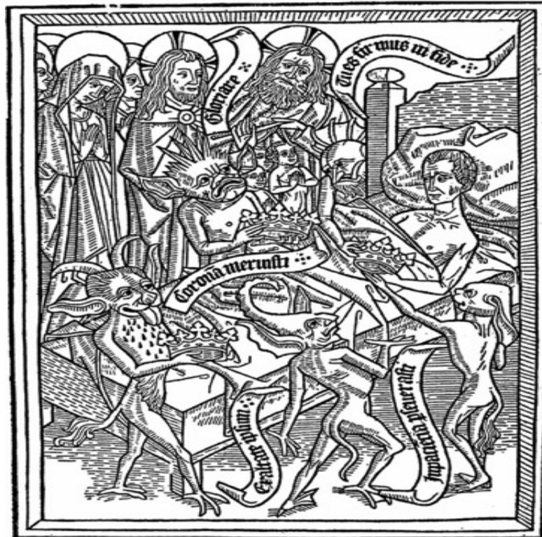
Figure 2. Master E. S., Ars Moriendi , 1464, woodcut from the Netherlandish Latin Text. Bibliothèque National of Paris (Photo credit: Public domain.wikipedia.org).