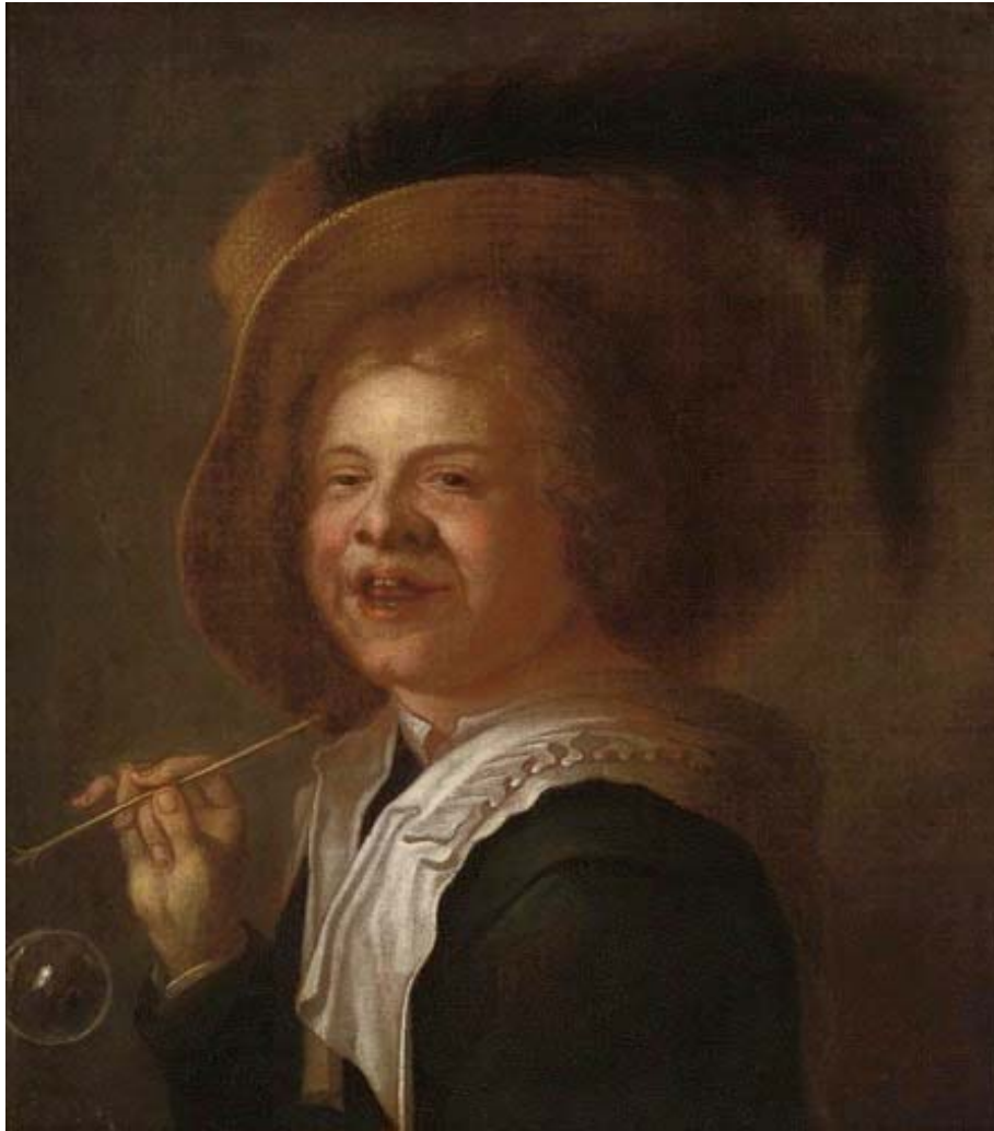
Figure 15. Judith Leyster, A Boy Blowing Bubbles , 1655. Christie's London, 24 March 2009, Lot 94. Public domain: commons.wikimedia.org.