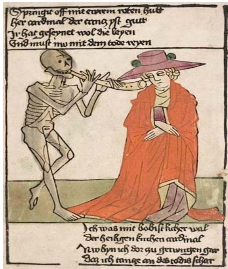
Figure 1. Totentanz , 1455, blockbook from the Codex Platinus Germanicus 438 (132r) at the University of Heidelberg, Germany.

The concept of pairing living figures with death continues throughout the 16th century and into the 17th in Europe.