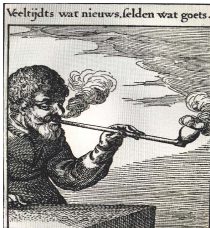
Figure 14. Roemer Visscher, Emblem X, from Sinnepoppen (Amsterdam: Claes Jansz Visscher, 1614).