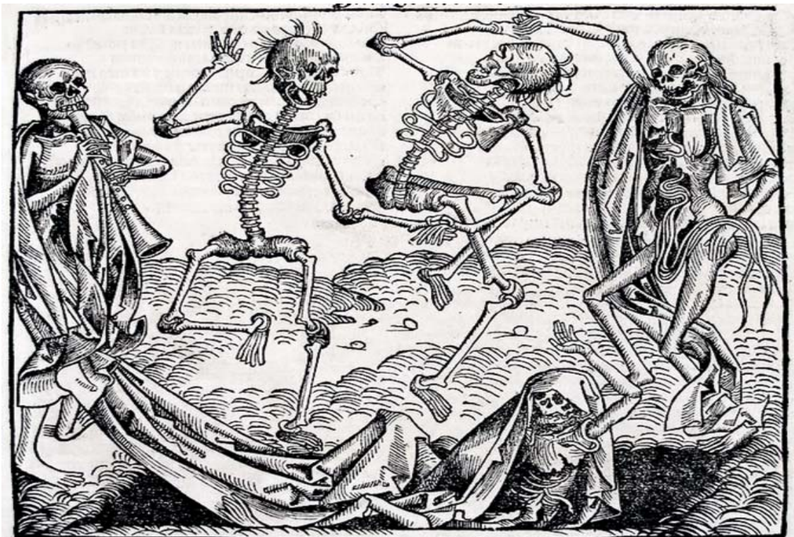
Figure 3. Michael Wolgenut, Dance of Death , 1493, woodcut from the Nuremberg Chronicles (Photo credit: Public domain.wikipedia.org).