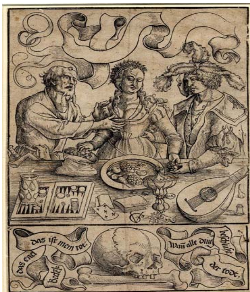
Figure 5. Urs Graf, Vanitas or Mercenary Love, 1511, woodcut after Hans Holbein the Younger. British Museum, London.