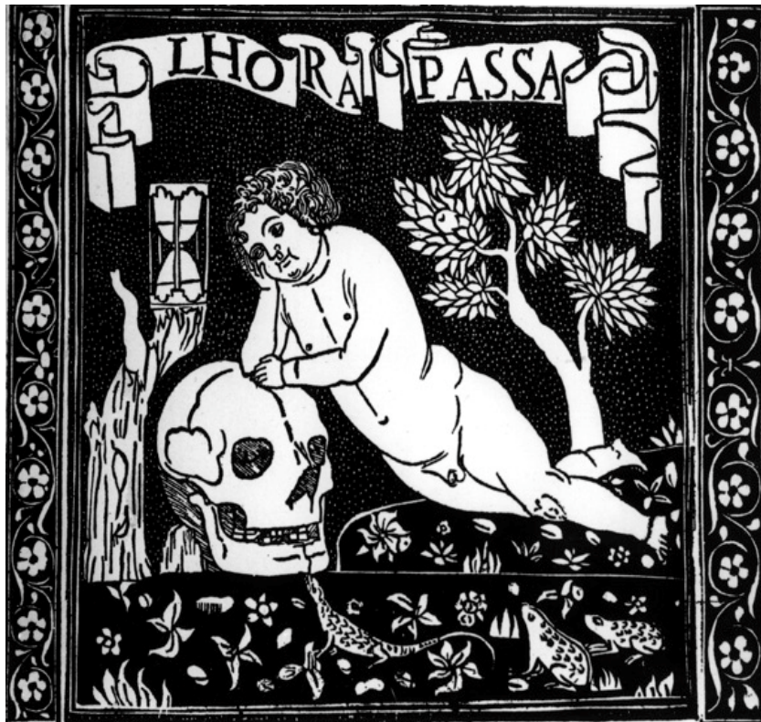
Figure 9. Anonymous, Italian Renaissance woodcut, L' Hora Passa , 1490. Bibliothèque Nationale, Paris.

Imageries of Homo bulla est (man [the individual] is a bubble) are depictions of an open landscape where a putto or a naked youth rests on a skull while blowing soap bubbles. This imagery is commonly illustrated in European emblematic books and prints of the 16th and 17th centuries (Sutton, 2012; Cheney, 1992). This essay briefly examines the complex symbolism of air, as an ephemeral state, as a reference to the terrestrial passing of life ( l' hora passa ). In an anonymous Italian Renaissance woodcut, L' Hora Passa (Time Passes), 1490, at the Bibliothèque Nationale in Paris (see Figure 9), the motto l' hora passa , inscribed in a scroll at the top of the imagery, illustrates this concept (Janson, 1937) 7 . The scene represents, perhaps for the first time in Italian Renaissance art, the depiction of an hourglass with a wingless putto. The naked youth intensely gazes at the hourglass while resting on a large skull. He is meditating on the passing of time in a landscape surrounded with blooming and dead trees, scattered flowers, and insects—frogs and lizards (Janson, 1937; Sez nec, 1938; Labno, 2016) 8 .