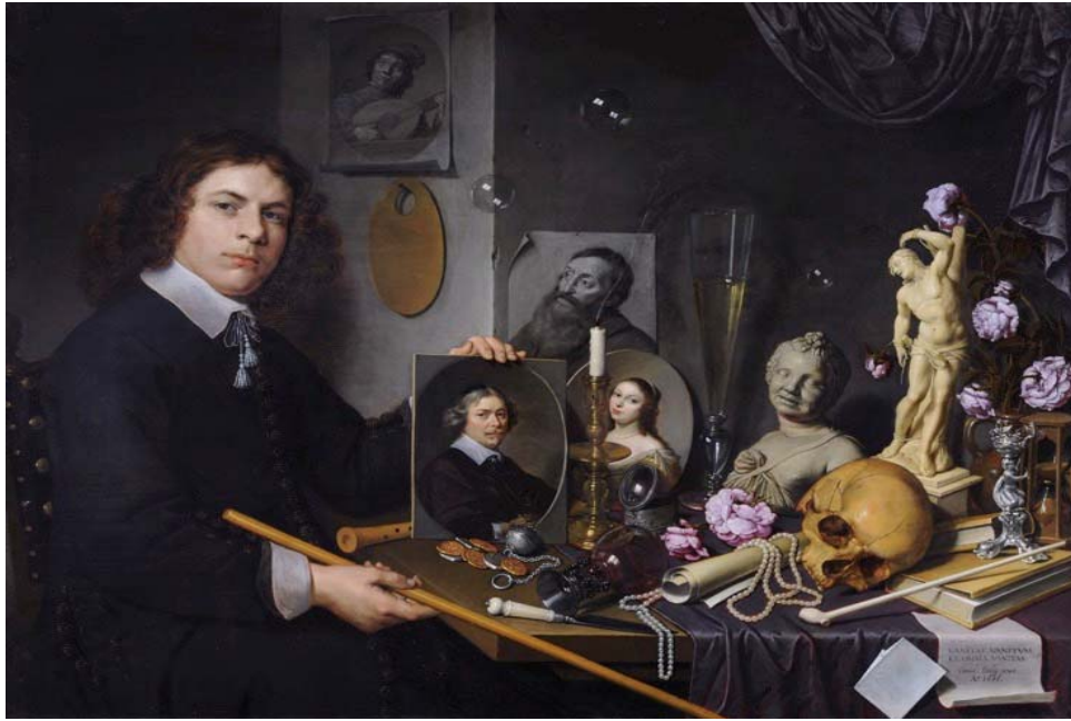
Figure 6. David Bailly, Vanitas With a Self-Portrait, 1651. Stedelijk Museum De Lakenhal, Leiden.