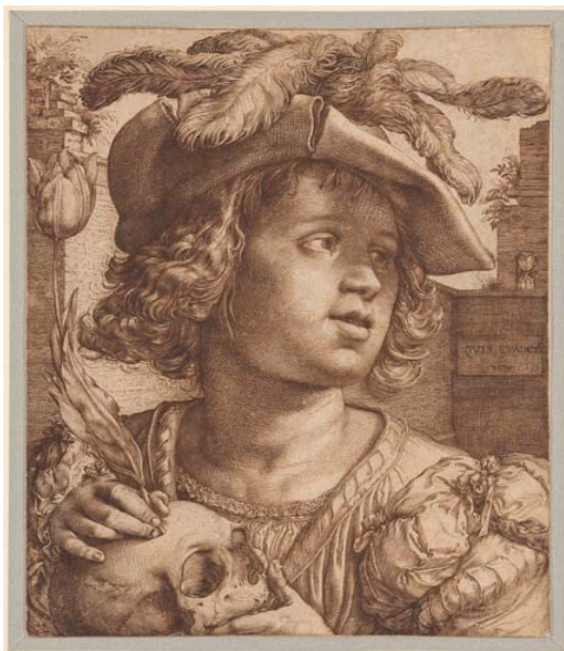
Figure 7. Hendrick Goltzius, Man Holding a Skull and a Tulip , 1614, drawing. Pierpont Morgan Library, NY. (Inv. III.145). Download image: 128202v-0001.jpg.