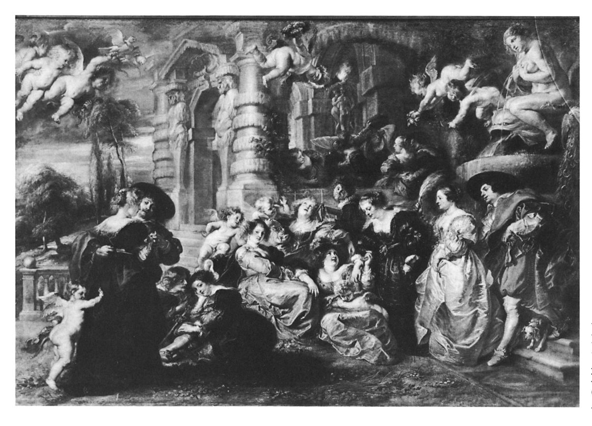
1 Peter Paul Rubens, Conversatie à la Mode. Madrid, Museo del Prado

fashionable society. This is already suggested by the earliest titles of the painting, "Conversatie à la Mode" and "Conversatie van Joffrs" (that is, a conversation of young ladies).<sup>3</sup>