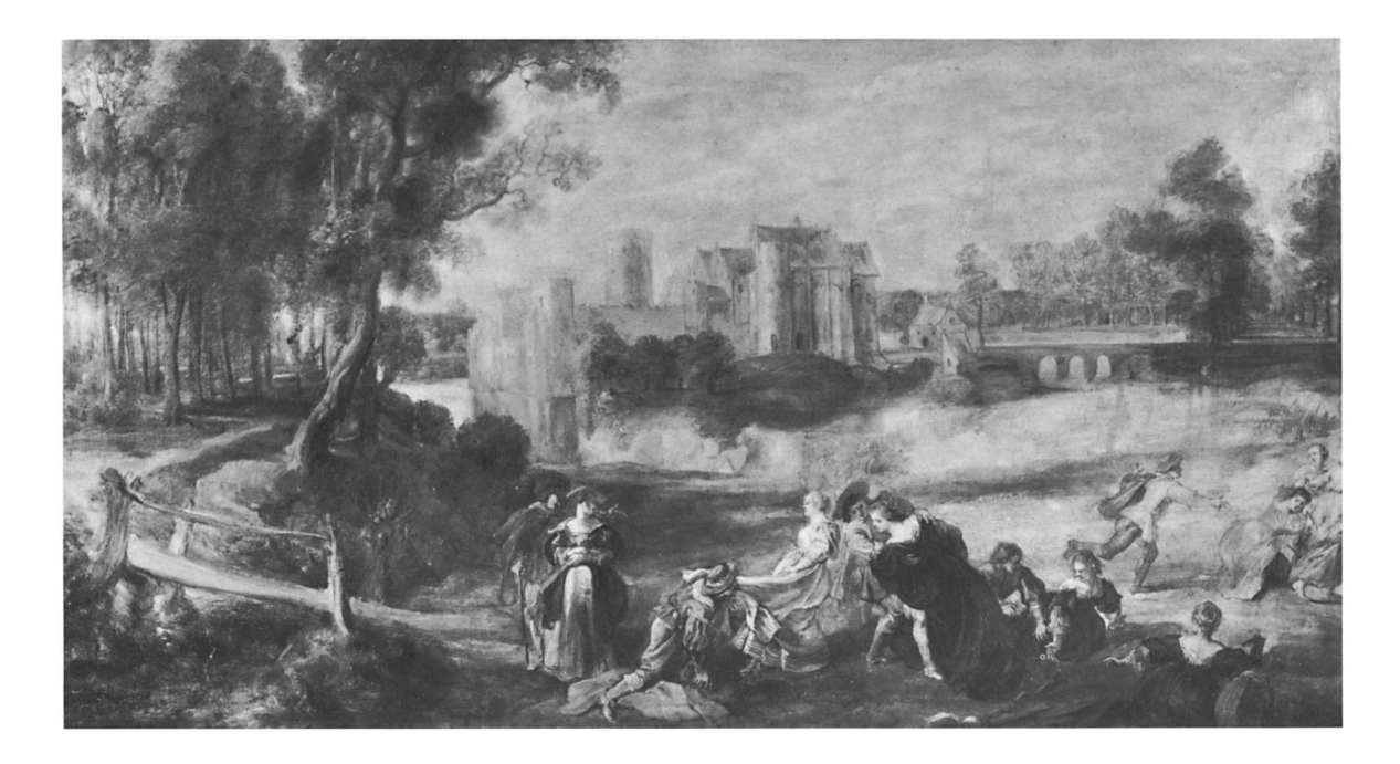
4 Peter Paul Rubens, Château in a Park. Vienna, Kunsthistorisches Museum