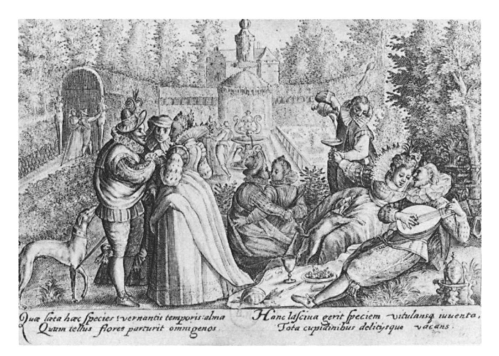
2 Crispin de Passe, Hortus Voluptatum. Paris, Bibliothèque Nationale, Cabinet des Estampes