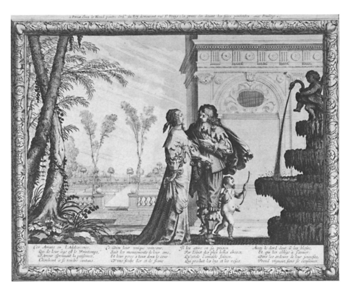
7 Abraham Bosse, Adolescence. Chicago, Art Institute of Chicago

ed above reality by the presence of emblematic figures. As in Le Jardin d'amour and in belles lettres in general, Rubens's gallants meet their ladies in an ideal place of recreation, where lute music and amorous serenades are performed.<sup>31</sup> One can imagine that the forlorn lutenist in the center of the picture plays a song in honor of les belles