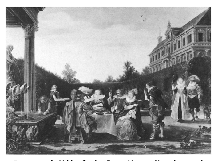
3 Esaias van de Velde, Garden Party. Vienna, Kunsthistorisches Museum

back, as some scholars have suggested, to the Renaissance and Mannerist periods. Giorgione's Conçert Champêtre and Titian's Mythologies have only a vague iconographic similarity to the Conversatie. 16 Bruegelian peasant pictures belong to a genre quite distinct from Rubens's fashionable society painting, and late Mannerist brothel scenes are equally improbable as generic models, since the spirit of their moralizing themes is utterly different from the joie de vivre that radiates from Rubens's picture. 17 Rather, it is more likely that Rubens drew upon contemporaneous tableaux de mode, which have themes similar to those he portrayed in the Prado painting. These genre pictures and amorous prints were produced in significant numbers for the haute bourgeoisie, and were widely collected by it in