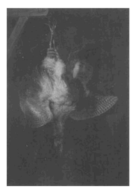
FIGURE 10 Rembrandt van Rijn, Se/fportrait with a dead bit/ern (1639). Gemaldegaleric, Dresden.

I suspect that Rernbrandr indulged in this practice as well. In the 1656 inventory of his possessions is mentioned a work described as 'a bitrern, after life, by Rernbrandt'r'" This is almost certainly the Self-portrait with Bittern (Fig. 10) of 1639, a portrait which in our time has been variously interpreted in terms of eroticism, social status, vanitas and natural ingenuity." Traditionally, imagination was considered part of that ingenuity. The latter is in keeping with what I would like to add to this bouquet of interpretations, that is, the possibility of a Rernbrandtian pun, which incidentally does not necessarily exclude other connotations,