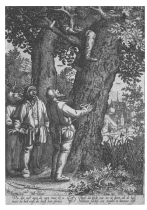
FIGURE 9 Claes [ansz, Visscher, etching after David Vinckboons, The birds-nester .

PAINTED WORDS IN DUTCH ART OF THE SEVENTEENTH CENTURY