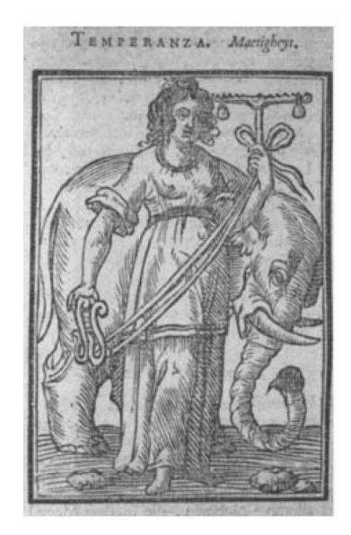
FIGURE 16 Temperance , illustration from Cesare Ripa, Iconologia , Amsterdam 1644.

I will refrain from giving an inventory of all the concepts and motifs derived from Ripa: after all, the necessary liberties were sometimes taken. Everything which was too obviously unrealistic was left out. As parspro toto , I will only show Temperance and Constancy (Fig. 16, 17): two of Rips's personifications which are imitated by the sitting girl with the bridle (but without Ripa's elephant), and the standing girl to the far right, who grasps a pillar and holds a sword above a fire. She is taken over wholesale from the Iconologia . 45