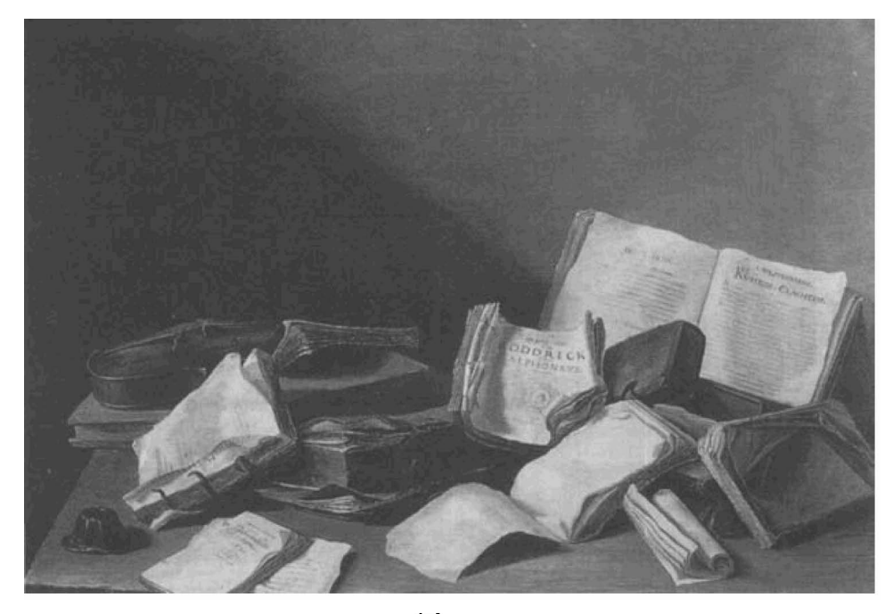
FIGURE 5 Jan Davidsz, de Heem, Still life with books (J 628). Mauritshuis, The Hague.

My interest is in art which somehow incorporates elements of language, painted words or expressions. In principle, two patterns can be identified here: words which are illustrated through appropriation of the actual letters; and words, texts, which have been transformed and assimilated into the rest of the composition. I will give two examples: a Still Life by Jan Davidsz, de Heem from 1628 (Fig. 5), in which words are depicted in their literal form, and a SelfPortrait by Rernbrandr" in which no letters appear but in which, if I am correct, a word is visualised which is meaningful for Rembrandt. We will return to that presently.