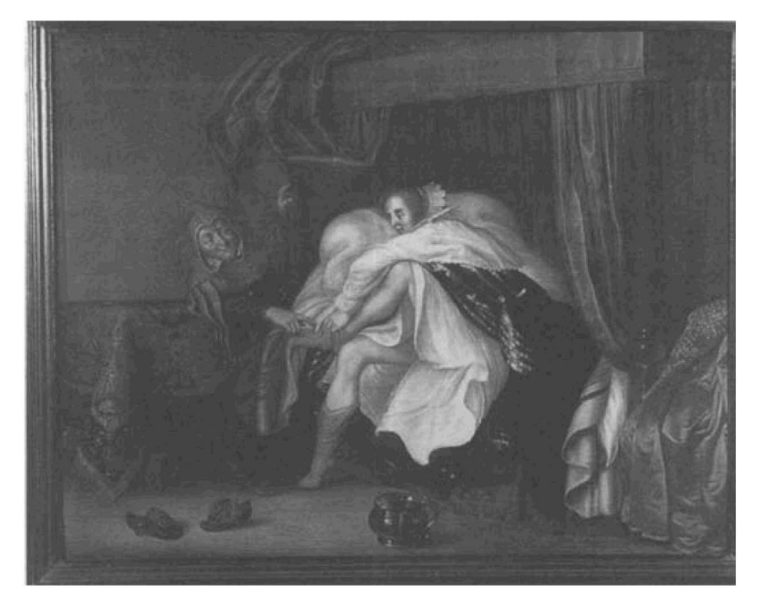
FI(;URE 13 Adriaen van de Venne, 'Geckie met de kous'; Muzeum Narodowe, Warsaw.

for example Adriaen van de Venne (Fig. 13) and, later in the century, Cornelis Dusart in a watercolour showing a Lascivious couple (Frc. 14), in which we see the woman demonstratively waving the garment in question."