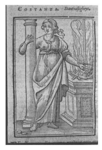
FI<;URE 17 Constancy, illustration from Cesare Ripa, Iconologia, Amsterdam 1644.

One could claim that the process of transformation in Mytens' picture is somewhat different since the people portrayed also had visual origins, starting in Ripa's woodcuts. On the other hand Ripa's text was also used and translated visually, a facet that would lead us too far astray to go into now. In any case, it does not seem exaggerated to me to characterise Mytens' painting as a particularly 'bookish' performance.