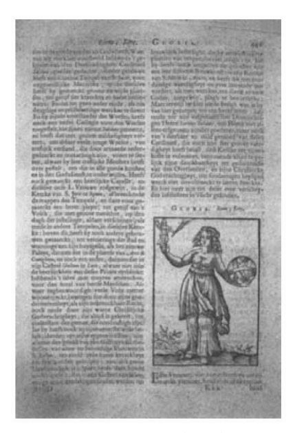
FIGURE 22 Page from Cesare Ripa, lconologia, Amsterdam 1644.