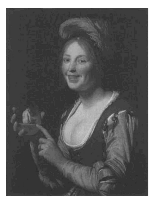
FIGURE 18 Gerard van Honthorst, Young womanholdinga medaillion (1625). City Art Museum, Se. Louis, Missouri.

An ingenious painting by Gerard van Honthorst of 1625 (Fig. 18) is a typical representative of seventeenth-century humour." It depicts a courtesan ostentatiously pointing