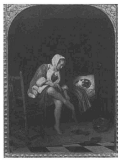
FIGURE 12 Jan Sceen, Woman at her toilet. Rijksmuseum, Amsterdam.