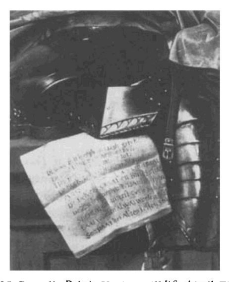
FICURE 25 Cornelis Brisé, Vanitas still life, détail Figure 24.