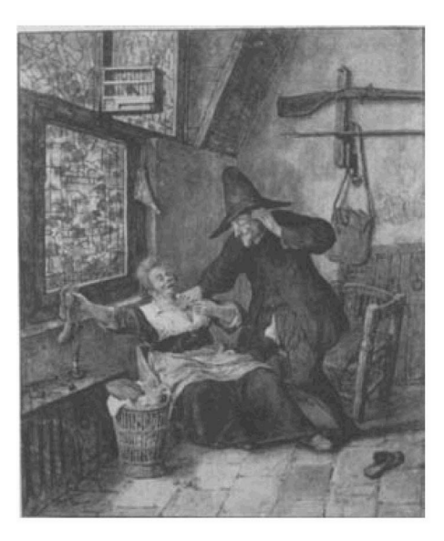
Figure 14 Cornelis Dusart, Lasciviouscouple (1687, watercolour). British Museum, London.

for example Adriaen van de Venne (Fig. 13) and, later in the century, Cornelis Dusart in a watercolour showing a Lascivious couple (Frc. 14), in which we see the woman demonstratively waving the garment in question."