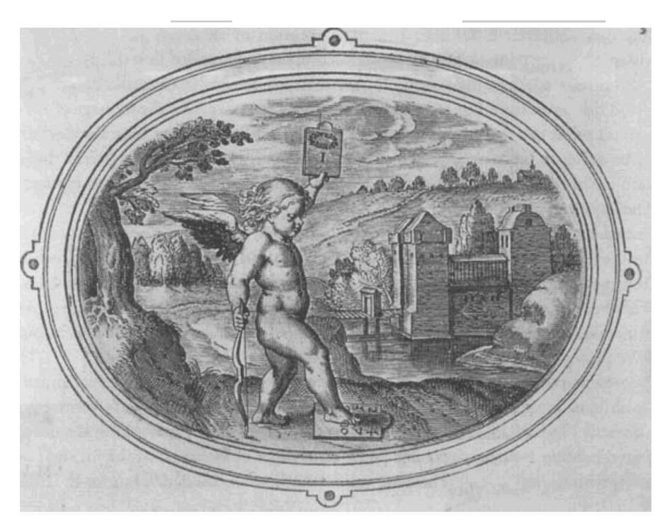
FIGURE 4 Ono Vaenius, 'Only One; emblem from Ono Vaenius, Amorum emblemata, Antwerp 1608.

ing I am assuming that Vermeer derived the god of love from an illustration in Octo Vaenius' extremely popular emblem book. the Amorum emblemata (Fu., 4).<sup>14</sup> The print in question shows the number 1 on the raised card (here actually a sign), while the cupid is standing on a board marked with the numbers 2 to 10. The accompanying motto and poem instruct us that it is allowed to love only one person. That is why Amor is demonstratively waving the number I and treading the higher numbers underfoot.