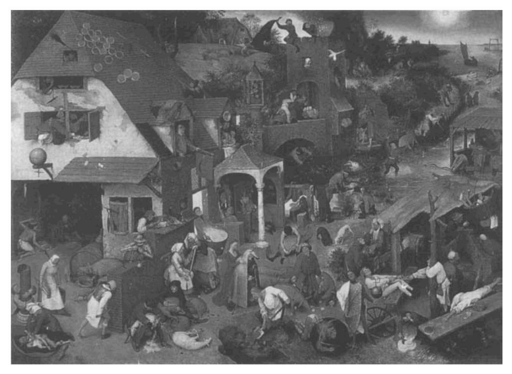
Fa;uRE 7 Pieter Bruegel, Netherlands proverbs (1559). Staatliche Museen, Gernaldegalerie, Berlin.

Although they were not usually published separately, this category also includes hundreds of poems about specific pictures, mainly portraits. I have already mentioned Vondel's two hundred works in this context." Whereas these are rexrs about depictions, there are also many depictions of texts, such as proverb paintings for example. Famous is Pieter Bruegel's painting of 1559, in which eighty-five proverbs and sayings are literally, as it were, transformed into images (Fig. 7).<sup>35</sup> We can find such transformations in many other paint-