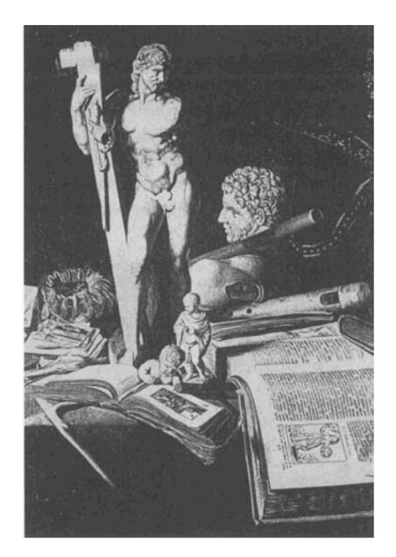
FIGURE 21 Edwaert Collier or Simon Renard de Sainr-Andre, Still life with sculpture. Whereabouts unknown.