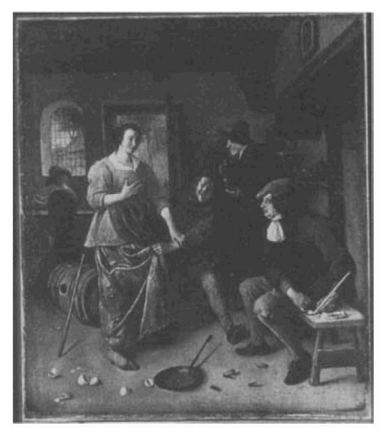
FIGURE 11 Jan Steen, The interior of an inn. National Gallery, London.

A consummate master in this respect was jan Steen (FK;. 11, 12). Considering the nature of seventeenth-century humour, we can assume that Sceens saucy puns and expressions casr in visual motifs were highly appreciated. His visualisation of an obscene expression about the filling of a tobacco pipe as an allusion to coitus is a typical example of this genre. Steen repeated the joke a number of times, just as he more than once played visual games with the ambiguity of the word 'kous', which apart from a stocking can also refer to the female sexual organs." Other artists amused the public in a similar way with stockings,