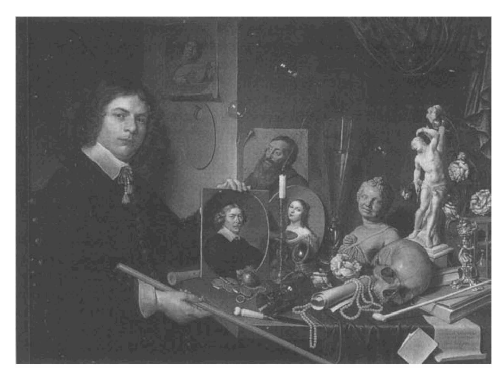
FIGURE 2 David Bailly, Se/fportrait with uanitas still life (1651). Stedelijk Museum 'de Lakenhal'. Leiden.

the two self-portraits of Bailly as a youth and as an old man, are difficult to understand as anything other than a traditional statement of man's mortality.