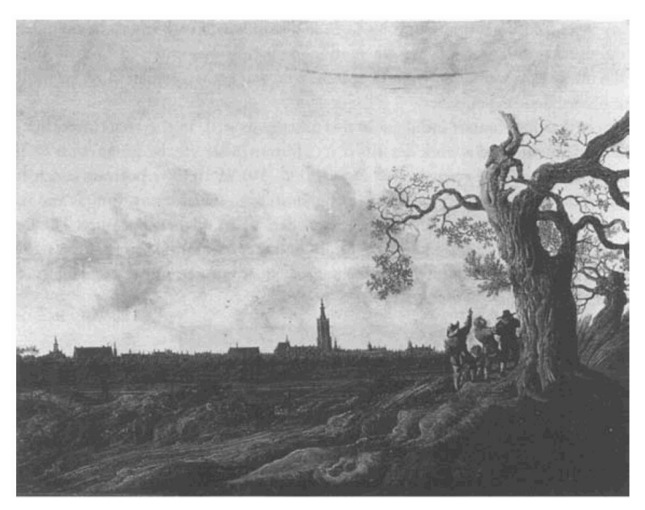
FIGURE 8 Anthonie Croos, Landscape with a view of The Hague (1665). Musee des Augustins, Toulouse.