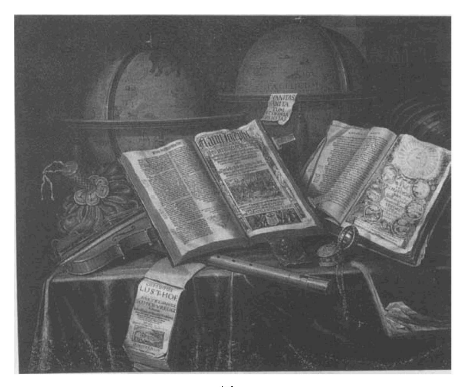
FIGURE 23 Jan van der Heyden, Still life with books and curiosities. Szepmuveszeri Muzeum, Budapest.

Collier and his followers were not the only ones to eagerly embrace significant books. Many other painters also incorporated primed matter wirh great refinement into canvas or panel. An exceptional picture was that by [an van der Heyden, better known as rhe painter of urban views and the inventor of the fire engine, but here excelling as a painter of valuable collectible items and two opened folios (Fig. 23).<sup>53</sup> They are, on the chair to the right, the Dutch Authorized Version of the Bible, and on the table, an atlas by Blaeu, the Toned des Aerdrycks . The texts have been included right down to the smallest typographical details with striking precision, just as the map in the atlas of fortifications at Bergen op Zoom are enormously accurate.