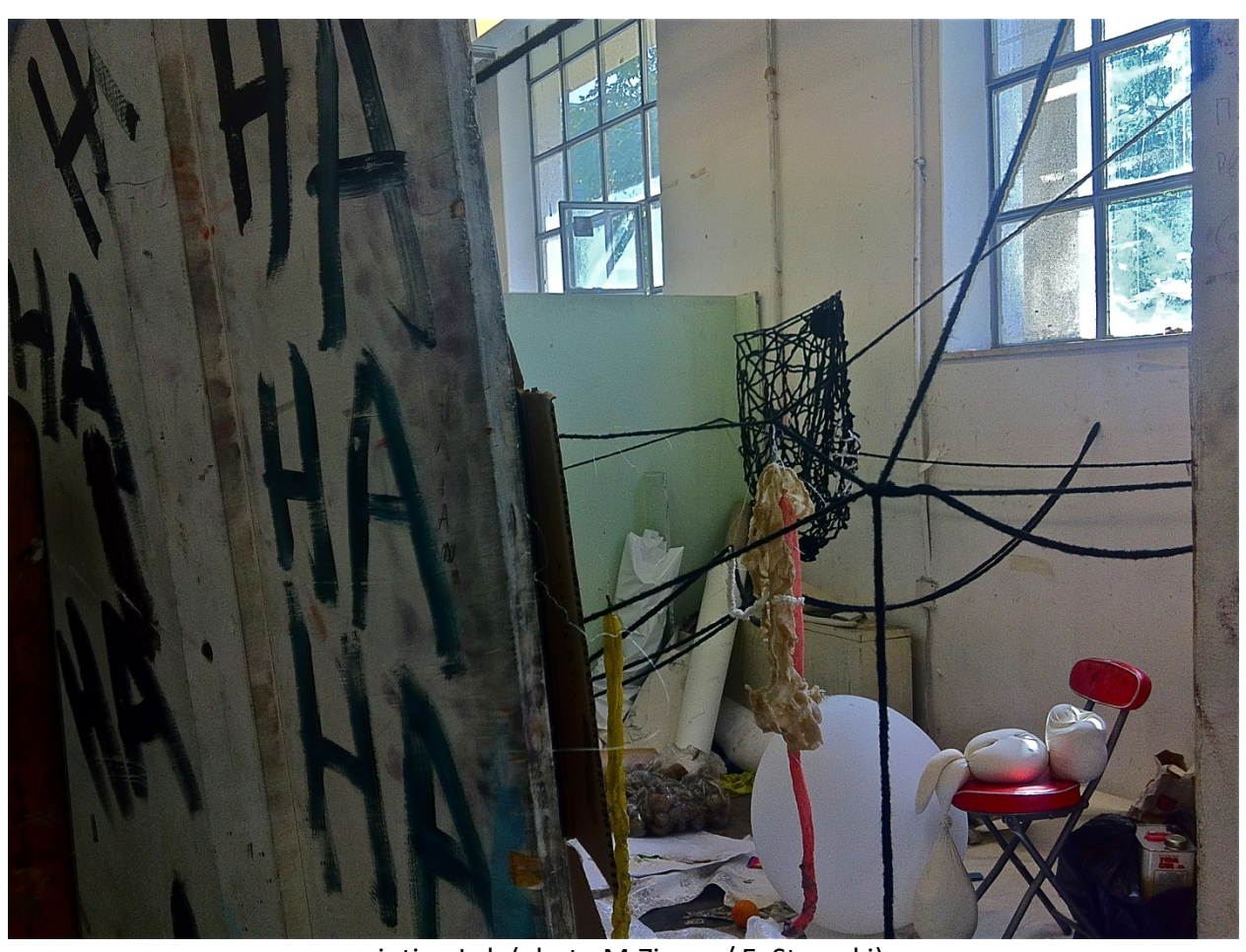
ainting Lab